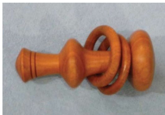
Figure 8. The finished baby rattle