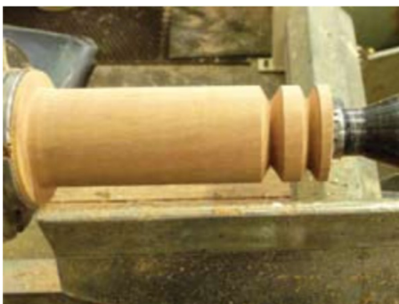
Figure 2. Two V-cuts have been made near the tailstock. The space in between the cuts will define the knob on the end for teething.

I begin by reducing the stock to about 1-1/4 to 1-1/2 inch in diameter. I never measure it but they just seem to come out about that size. I make a "V" cut with the skew close to the tailstock, but far enough away so that there will not be a problem with the center hole winding up in the end of the rattle. Don't cut this "V" too deep right now. Another "V" is now made to the left of the first one about 5/8-inch center to center. This "V" is the beginning of the recess where the rings will slide freely to rattle. Cut this a bit deeper, about 3/8-inch deep should do the job. See Figure 2.