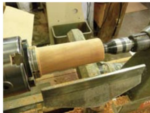
Figure 1. Here the wood has been turned round and to about 1-1/2" in diameter.

I've used about every type of hardwood for these rattles, but I find that the harder and closer-grained the wood, the better the ring cutting tools work. The rattle I made for this article was made from a chunk of plum wood and I used the Robert Sorby 1/4-inch set of ring cutting tools. The wood had been curing for about ten years, so it was very dry. I recommend that you use a slightly more wet wood to make your first few baby rattles--it turns easier. I used my Teknatool Nova DVR 3000 lathe. The wood was turned round and sized to fit the Super Nova2 chuck on my lathe, see Figure 1.