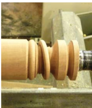
Figure 5. Starting the second loose ring.

Using the skew chisel, I cut a "V" about 1/2 inch to the left of the ring recess and another one about one inch further to the left to define the far left dimension of the rattle, also the end of the handle. Form a bead between the handle and the ring recess. Make this bead smaller than the ring diameters, but larger than the inside diameter of the rings--you don't want them to slip off.