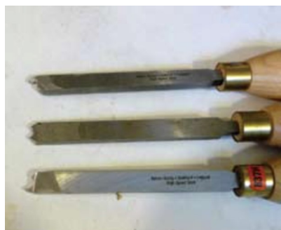
Figure 7. The Robert Sorby tools used in this project: (top to bottom) Right hand side tool, beading tool, and left hand side tool.

After I'm satisfied with the sanding job, I cut the V's at each end down to about 1/8-inch, just enough to still hold everything together. I prefer to separate the rattle from the rest of the spindle with a knife or saw. I use a knife to pare off the excess and then hand sand to smooth each end.