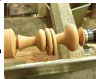
Figure 6. Here the piece is pretty much ready for sanding.

Add a coat of non-toxic oil and you have a completed rattle. I used the Mahoney Walnut Oil finish, which works very well. The finished baby rattle is not too large, but it meets the minimum size requirement for baby toys.