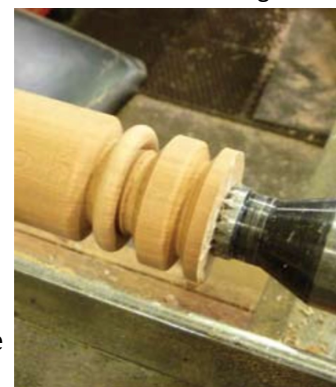
Figure 4. Here the ring is nearly cut loose. I finally cut the ring loose with the tool on the left side of the ring.