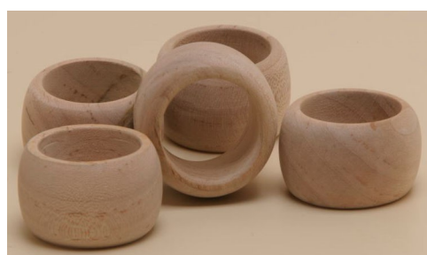
Bev deYampert ↑