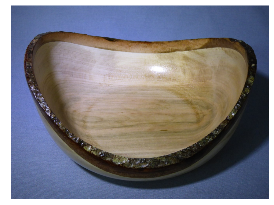
Natural Edge Bowl & 6 Weed Pots by Jerry Schnelzer