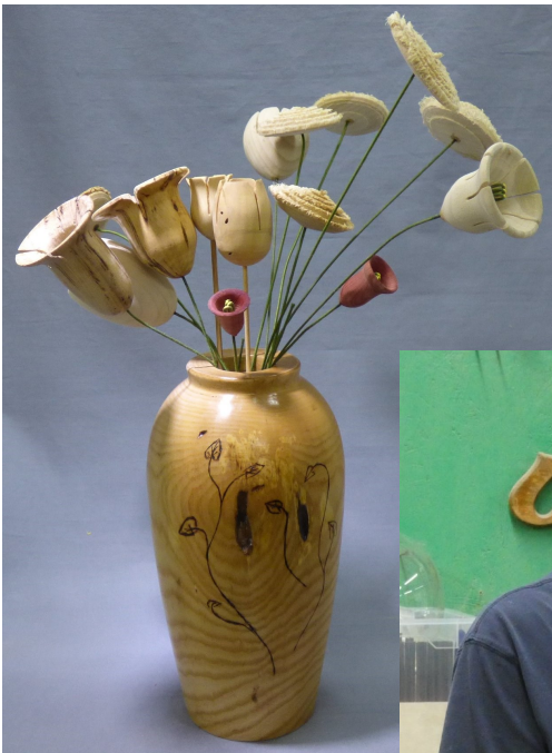
Don Moore demonstrated the art of making flowers during the first session with some creative designs.