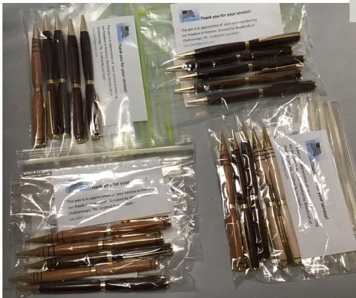
Created by Les Isbell Earring Holder Beads of Courage Box with tops Pens for the Troops