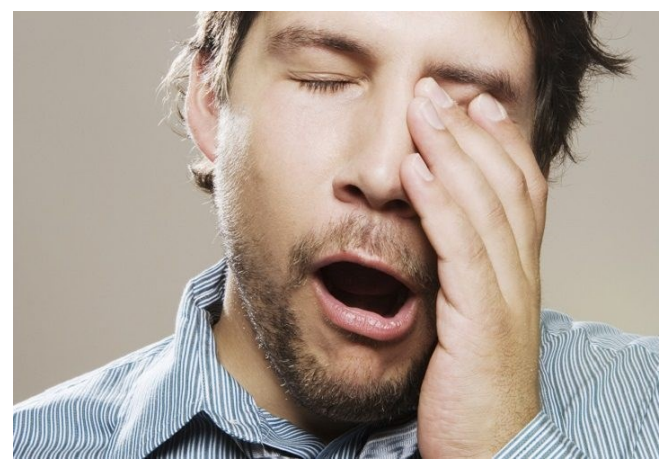
When do you turn or should I ask when do you stop turning. Working with power tools can be dangerous if used when tired. It is probably a wise decision to not turn when you are tired.

Thinking about this issue it might serve each of us well to make the decision ahead of time to not turn when tired. Some turners refuse to turn after dinner in the evening in order to be alert when standing behind a lathe. The primary decision must be to not turn when tired. This may seem like an obvious decision but we all profit from a reminder. Let this be a good reminder for all of us.