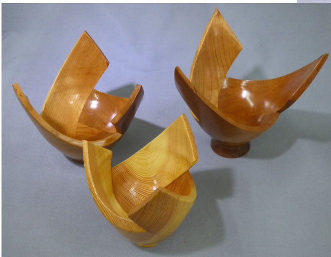
Bottom 2 pictures Charles Jennings made these