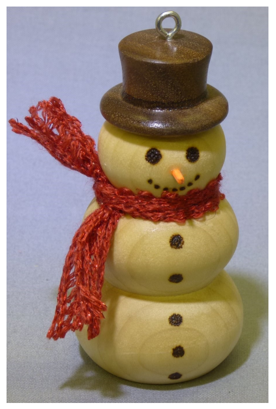
Bev deYampert ↑