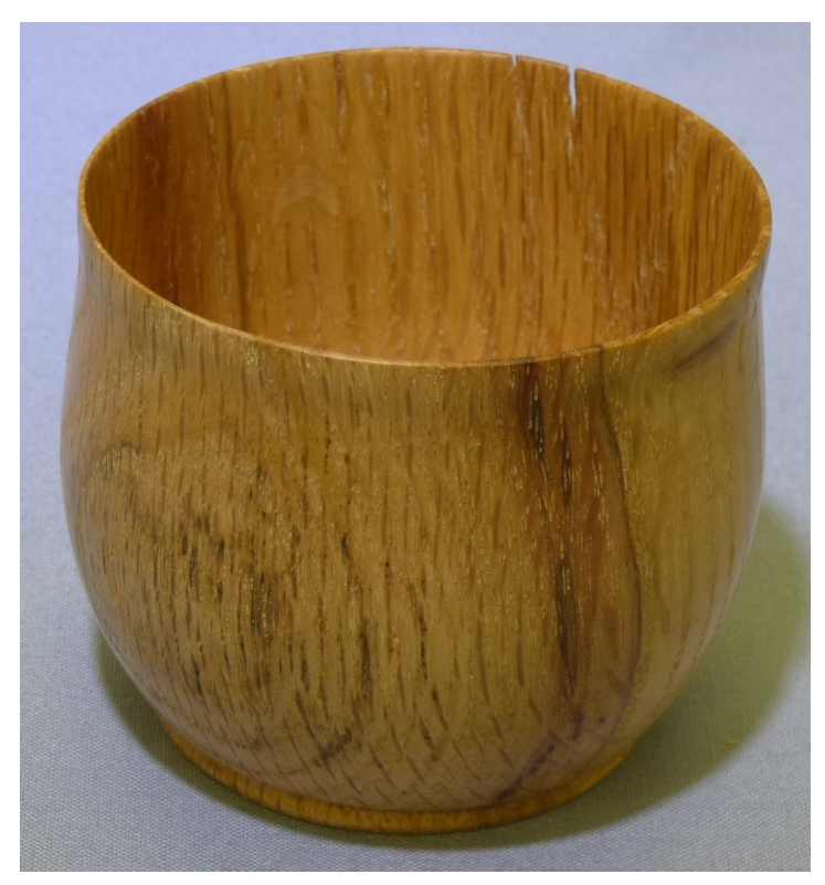
CUTS AND SCRAPES