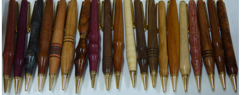
Pens for Troops \uparrow & BOC Box by Jim Dvorak \rightarrow

Pen for Troops \checkmark & \checkmark Ornaments by Les Isbell