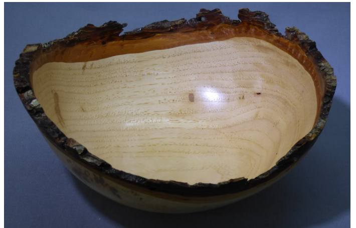
↑ Top 4 Bowls created by Gene Payne ↑