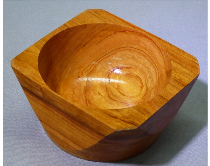
Items on this page were created and turned by Les Isbell