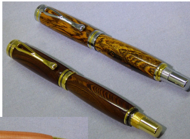
The Vase to the Right and two pens were turned by Seth Eichenberger plus the Pen for the Troops ↓ →