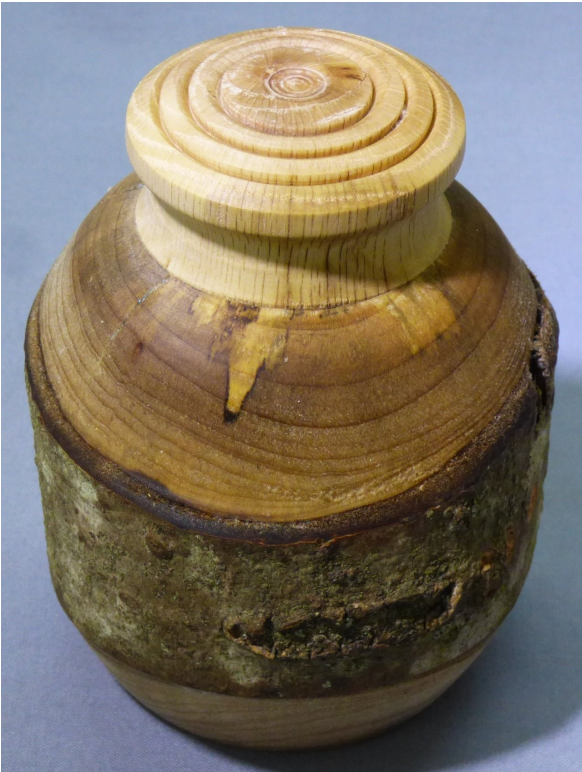
The top 4 pictures Feature items by Eric Schaffer