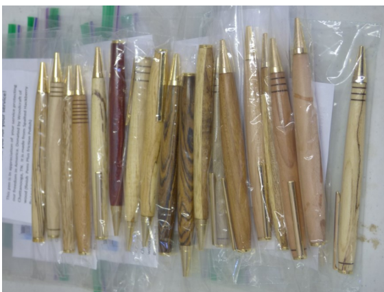
Pens for the Troops ← Les Isbell Jim Devorak →