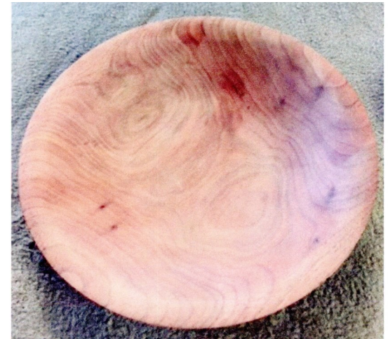
Dish top →