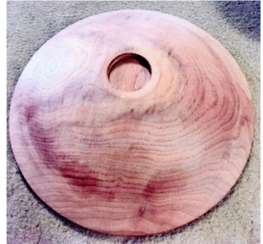
Base top →