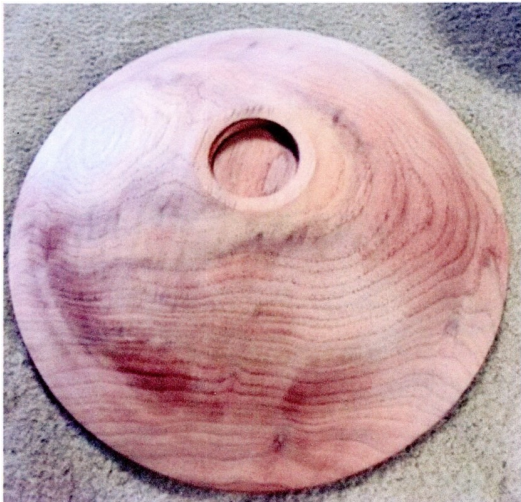
← Dish bottom