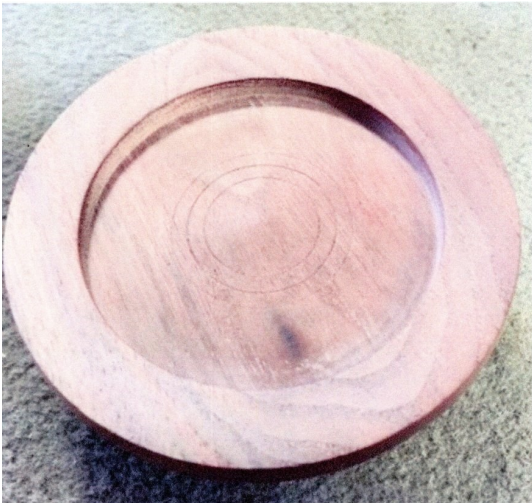
← Base bottom