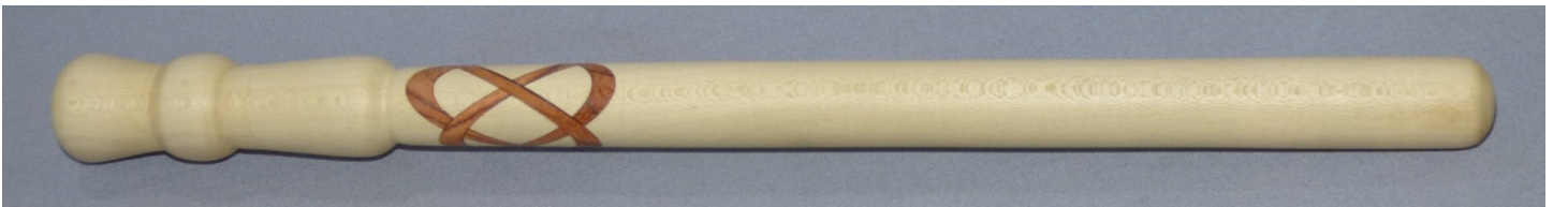
↓ Spurtle and Rolling Pin designed and made by Les Isbell