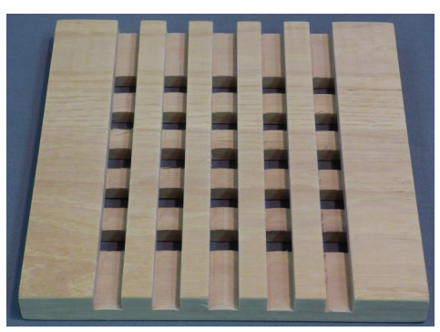
Bottom 3 - Les Isbell