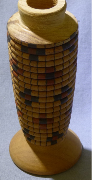
← Beverly deYampert