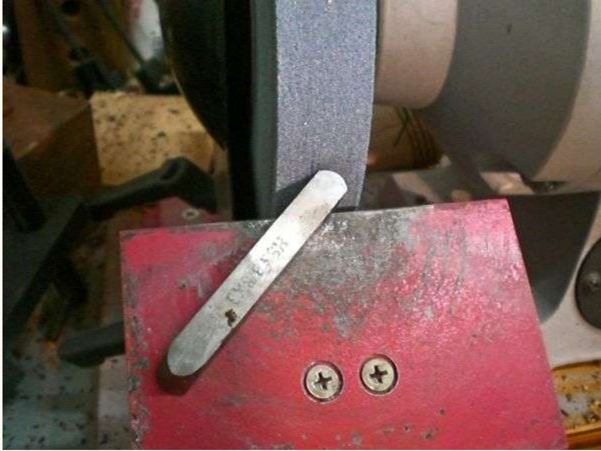
And one more shot, showing that the angle of the grind stays the same as the bit is swept through the radius...