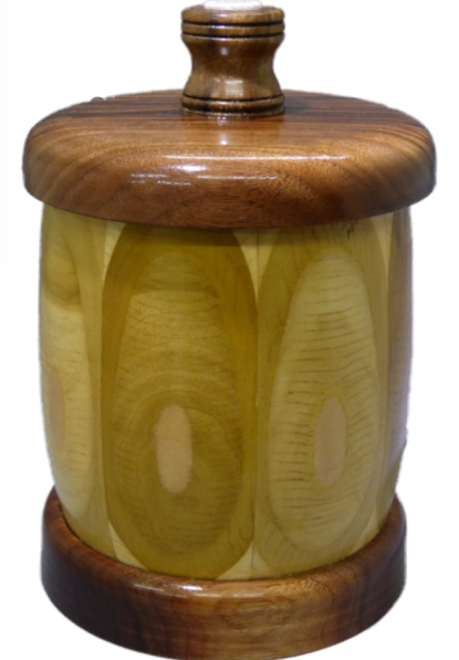
Don't forget the opportunity to give to others by turning one of the donation projects; Beads of Courage Box, Pens for the Troops or Ornaments.