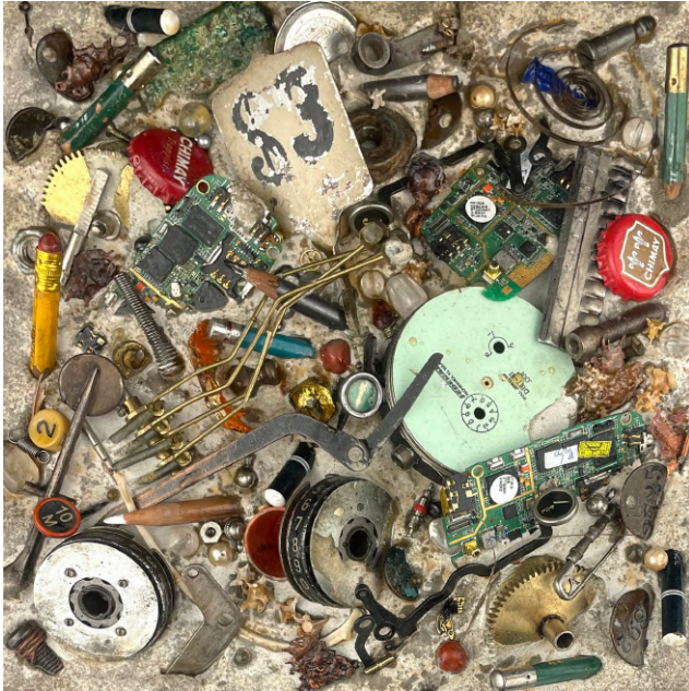
SONO OSATO Midden Lot 12, 2026 Assemblage, found objects in concrete 9.5 x 9.5 x 3 inches $500