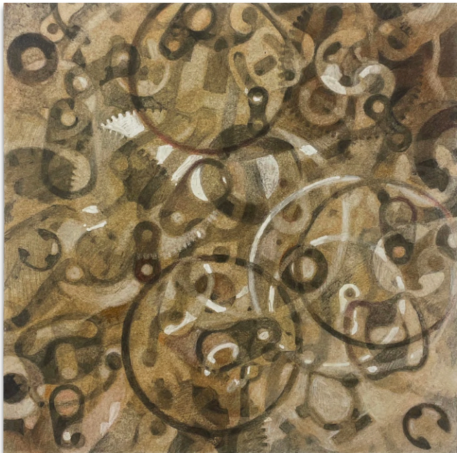
SONO OSATO Midden #13 , 2026 Dry pigment, pastel, graphite and colored pencil on paper 8 x 8 $1,000