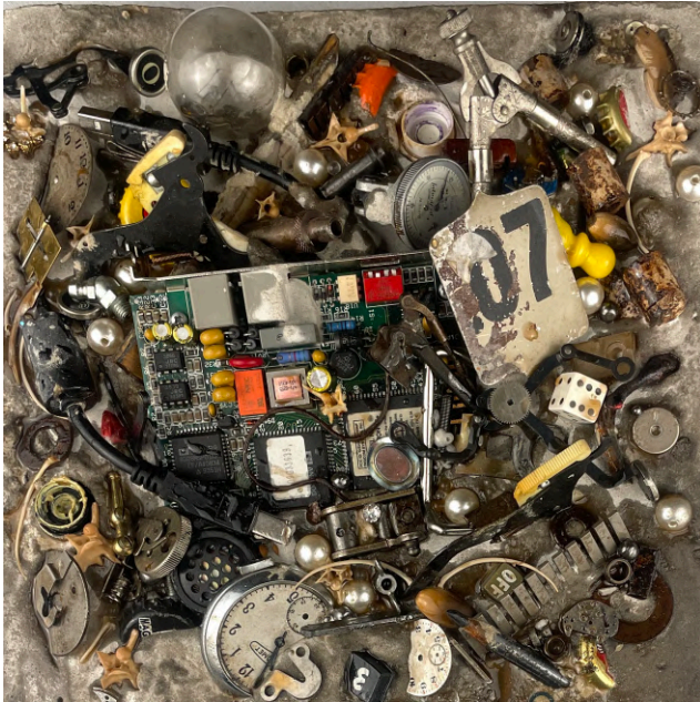
SONO OSATO Midden Lot 6, 2026 Assemblage, found objects in concrete 9.5 x 9.5 x 3 inches $500