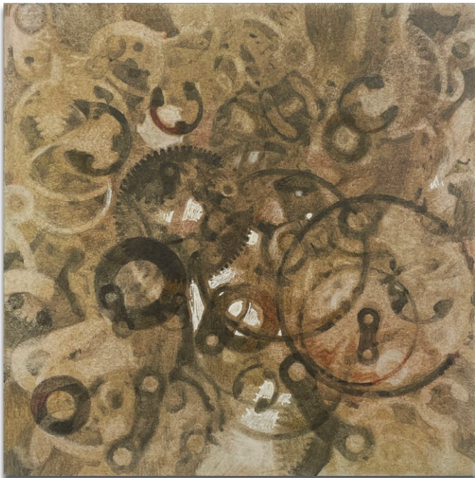
SONO OSATO Midden #14 2026 Dry pigment, pastel, graphite and colored pencil on paper 8 x 8 $1,000