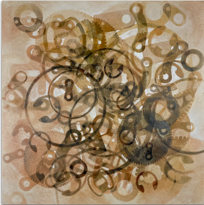
SONO OSATO Midden #11 , 2026 Dry pigment, pastel, graphite and colored pencil on paper 19 x 19 $2,550