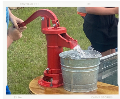
CRAFTS & GAMES