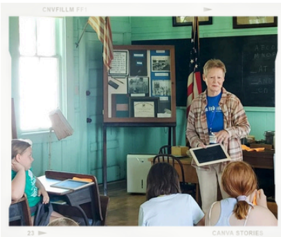
ONE ROOM SCHOOL HOUSE