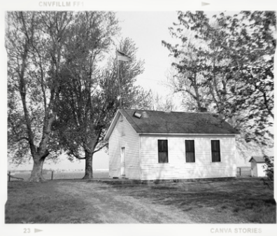
ONE ROOM SCHOOL HOUSE