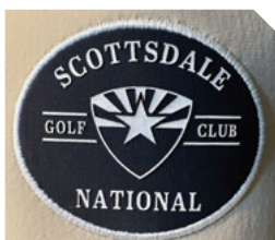
High Density Print on Fabric Patch w/ Raised Edge or Satin Stitch