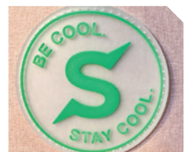
Clear Silicone Rubber Patch Single Color - Recommend use on Light Color Fabrics