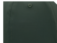
Shown w/o Perforations (Solid Fabric)