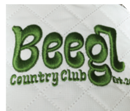
Raised Satin Stitch