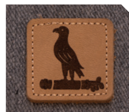
Laser Etched Leather Patch *Available in Brown & Tan