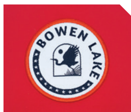
Woven Label w/ Satin Stitch