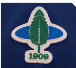
Silicone Rubber Patch Up to 5 Colors