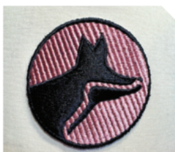
Raised Diagonal Stitch w/ Flat Embroidery