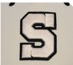
3D Puff Raised Embroidery