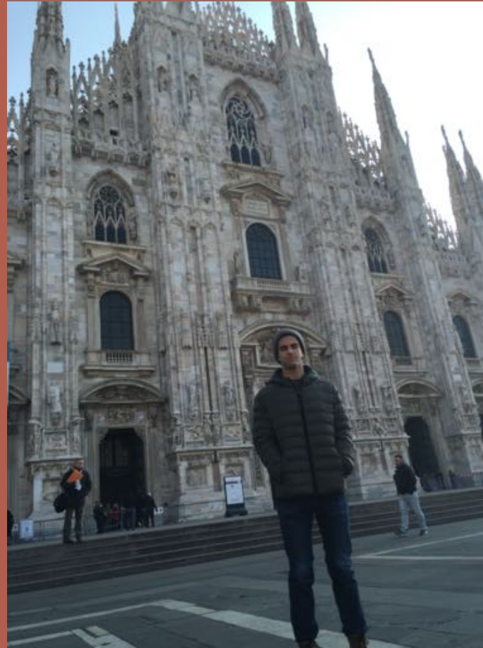
Duomo di Milano

Learning about different religions allows you to relate to individuals across the globe. Although religions have many disagreements, they all have the commonality of being moral compasses. Anyone can learn from the ancient wisdom of any other religion, regardless of their own beliefs.