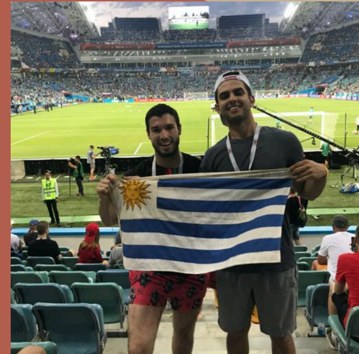
Portugal vs. Uruguay (Sochi)