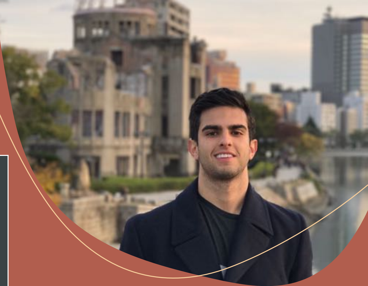
Hiroshima , Japan

I have treated my travels like cultural and educational experiences. Learning about the past is the most efficient way to be prepared for whatever the future may hold. Sights such as Hiroshima's blast hypocenter are reminders of the worst aspects of humanity and teachers about how to act as human beings moving forward.