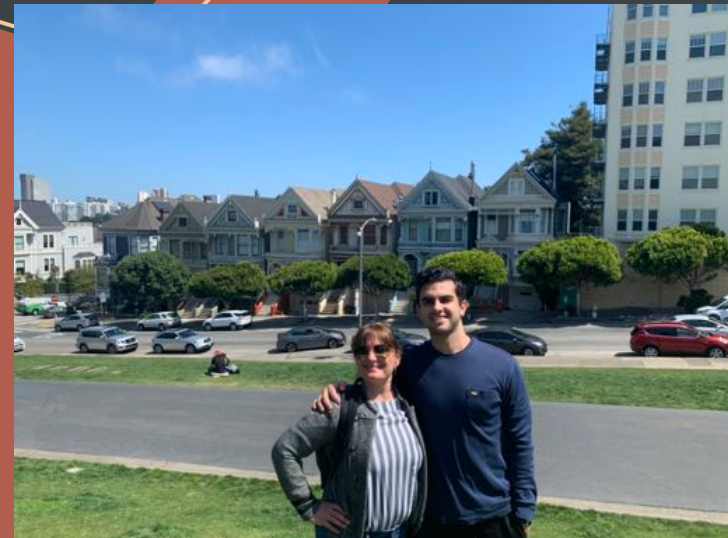
Painted ladies, San Francisco