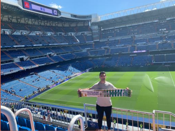
Santiago Bernabeu, Madrid

Traveling has allowed me to follow my other passion, soccer