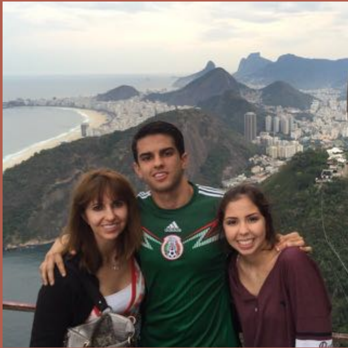
Rio de Janeiro, Brazil