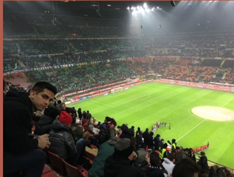
San Siro, Milan