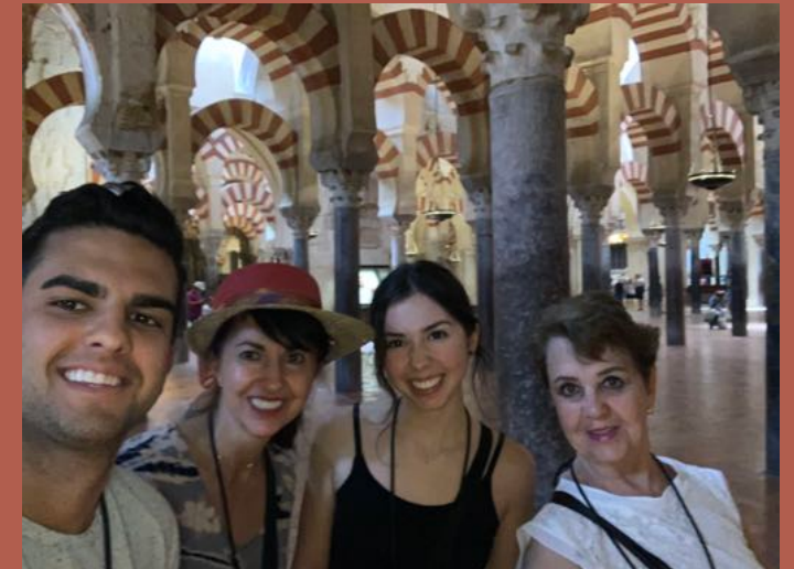
Mosque of Cordoba