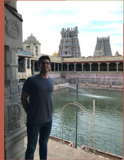
Meenakshi Temple, Madurai, India