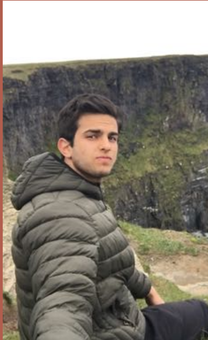
Cliffs of Moher, Ireland

Visiting natural wonders around the world has motivated me to emphasize sustainability in our own business. Specialty Fruits is now a fully organic operation and we work continuously to lower our carbon footprint