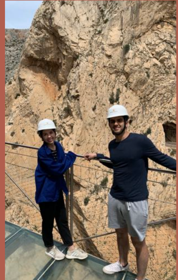
Caminito del Rey, Andalucía, Spain