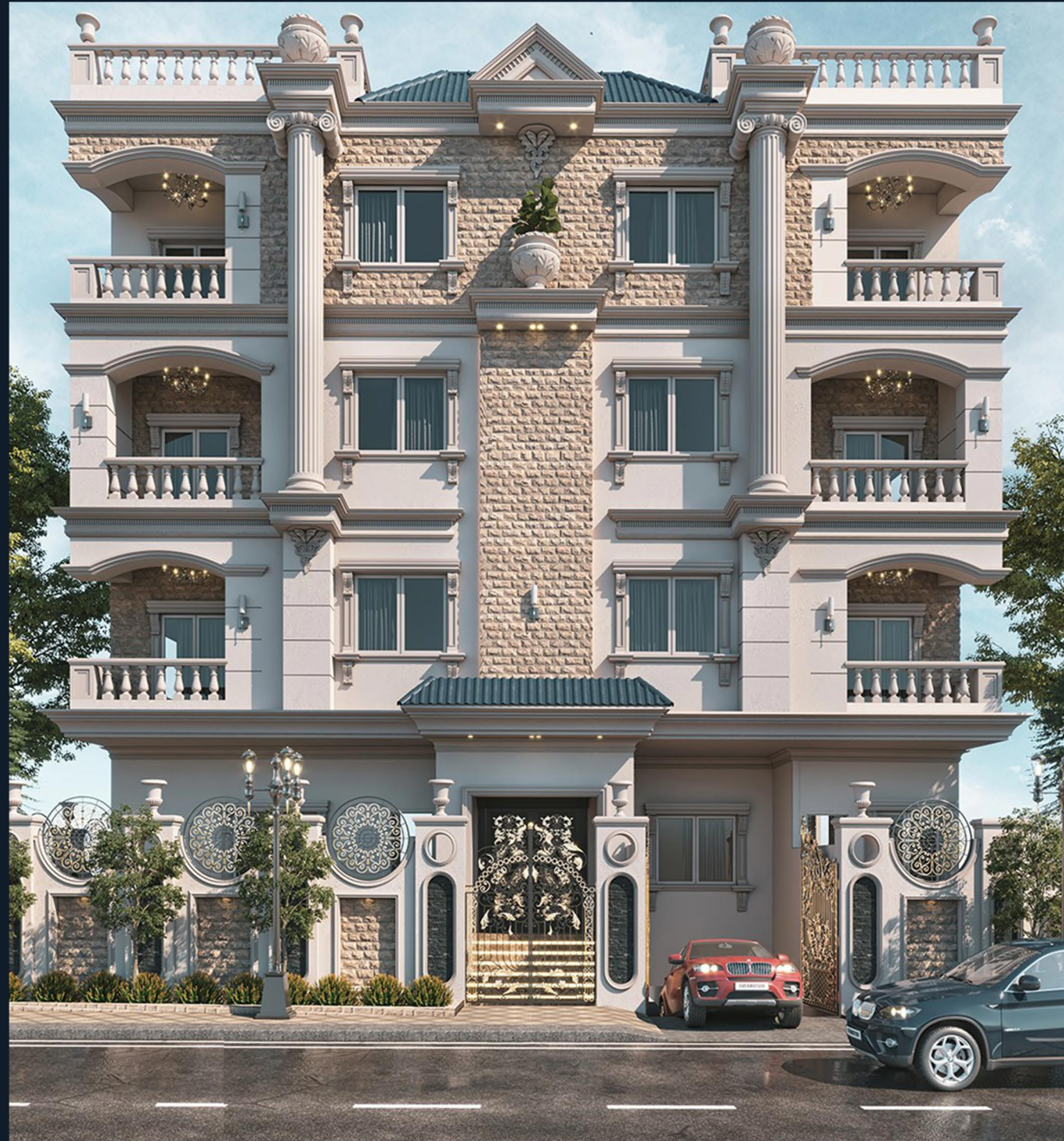
B25 BAIT EL WATAN