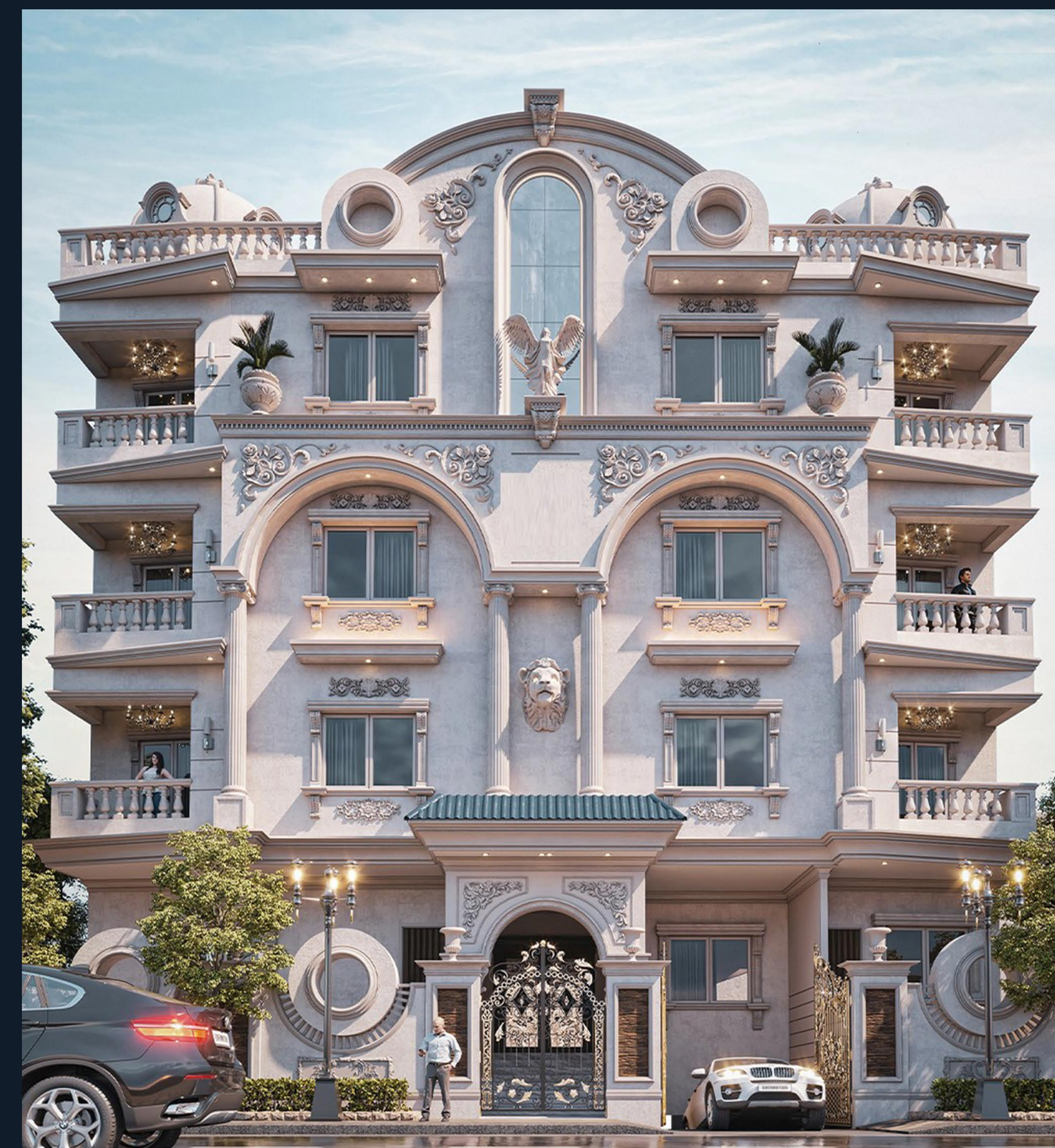
C199 NEW NARGES