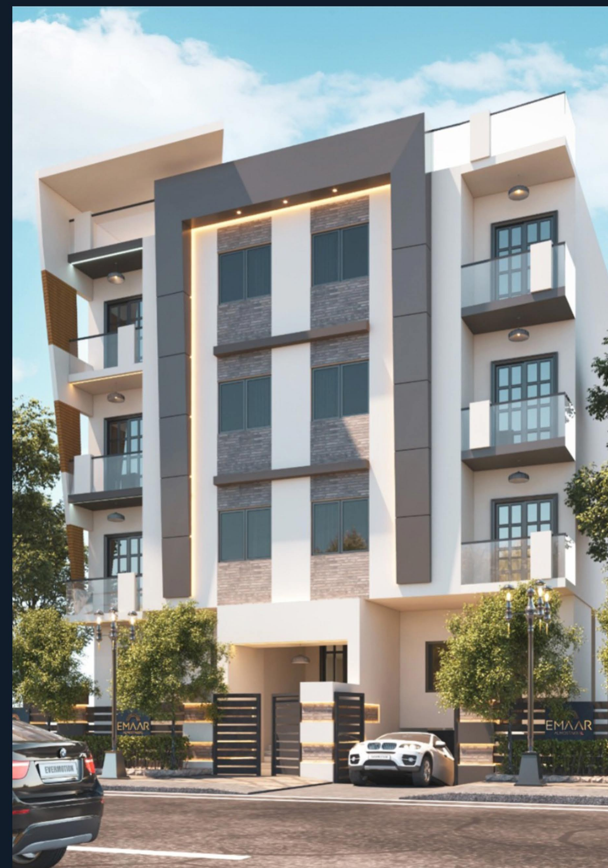
D48 NEW NARGES