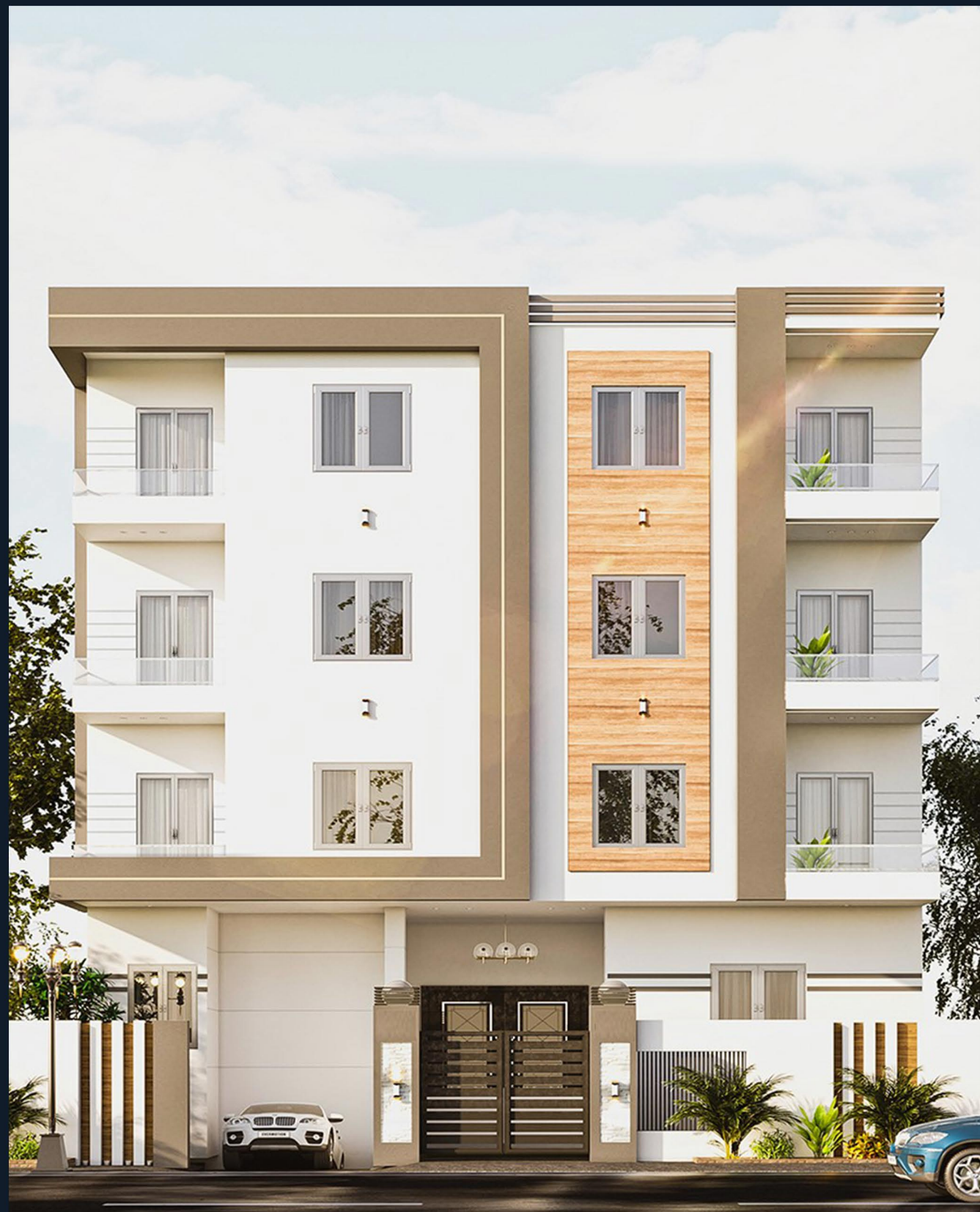
L80 NORTH REHAB