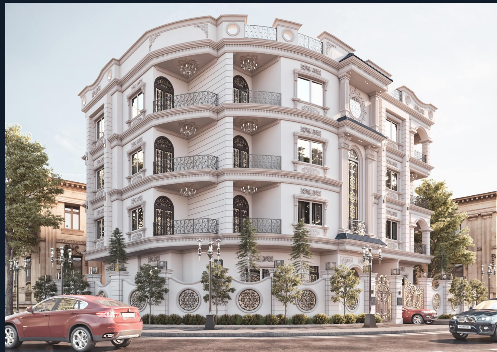
C137 NEW NARGES