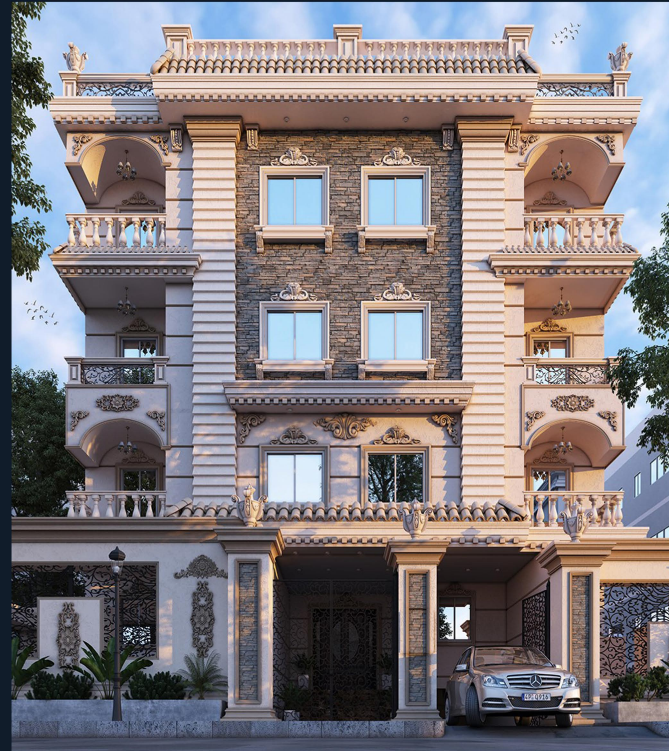
M89 BAIT EL WATAN