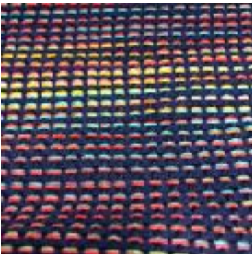
Using a split warp method to create texture. Above is the edge pattern.

PPI: 4 for open weave, 8 for packed weave but this project feels better between 4-5 ppi to reveal rainbow.