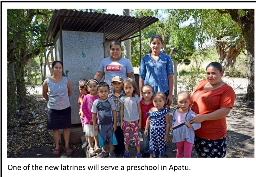
One of the new latrines will serve a preschool in Apatu.

The COM Missions Committee has donated $3,000 to the spring campaign, which will be matched by the Jackson Kemper Foundation. Individuals can also make a high-impact contribution today as every dollar raised during this spring campaign will be matched dollar-for-dollar. The $50,000 raised will provide the resources needed so that the residents can build these latrines to improve their health and environment as well as reduce the spread of illnesses.