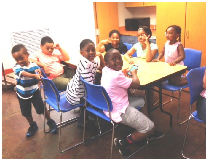
Children finish their lunch and await visit to EdVenture.