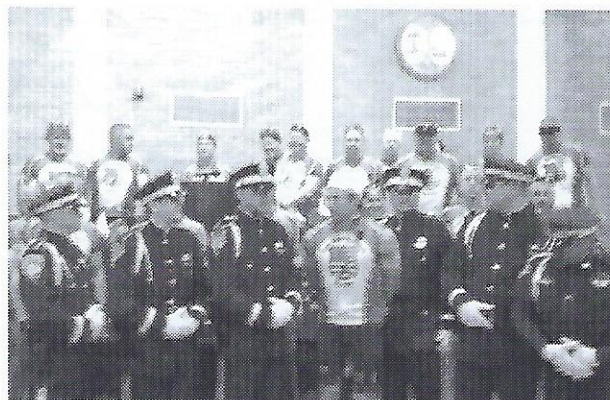
L.E.U. bikers with Greenville Police Department Color Guard following Memorial Service at the Criminal Justice Academy on May 3, 2017.