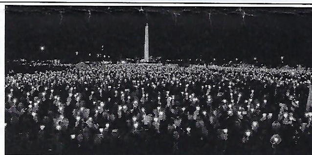
Scene at Candlelight Vigil on May 13, 2017, during National Police Week in Washington, DC.