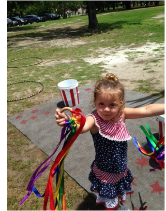
FUN AT BRITTLEBANK PARK IN CHARLESTON