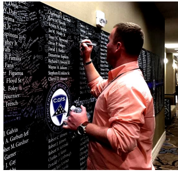
National Police Week