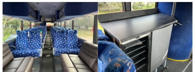
A Game/Sleeper Booth & Coffee Bar

We added two Sleeper Sofas & two Refrigerators