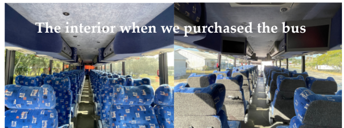
The interior when we purchased the bus

We began immediately to make it our own by retrofitting several things.