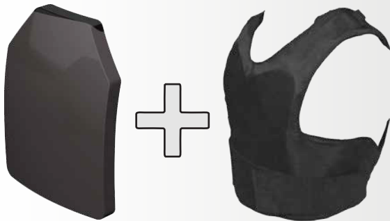
Level E ICW 1.95lbs