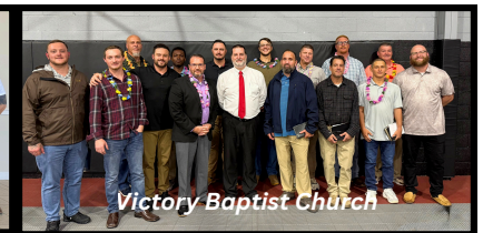
Victory Baptist Church