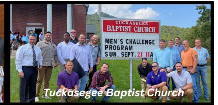
Tuckasegee Baptist Church

Thankful for the recent opportunity to share testimonies and worship with these wonderful congregations.