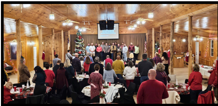
Our annual Christmas Banquet for our Staff, Volunteers and Board Members.