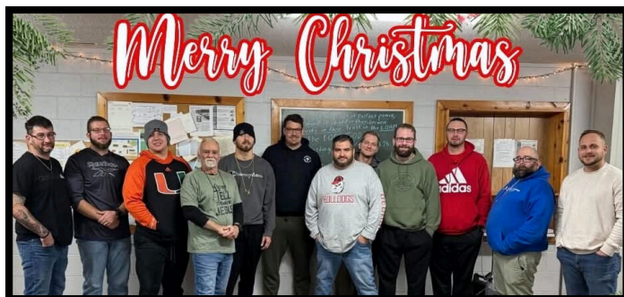
We want to say a huge "Thank You" to those who donated to the men so they could have an amazing Christmas Day. Thank you for your continuous support to MCS!