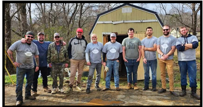
Another productive Mission Monday starting out in the Bee Tree Community in Swannanoa. The men were able to help a single mother and her children by cleaning up debris on their property. We finished the day by helping a local church. What a blessing it is to serve others!