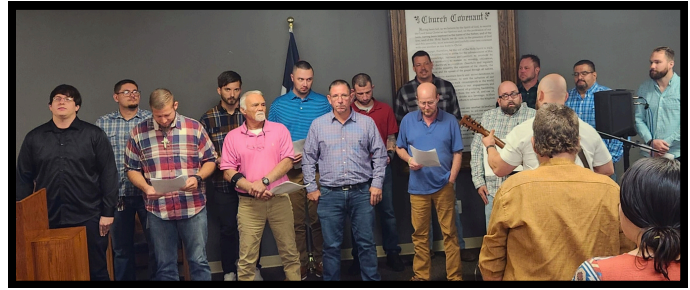
Thankful for the recent opportunity to share testimonies and worship with these wonderful congregation of Shepherds Call Baptist Church in Robbinsville.