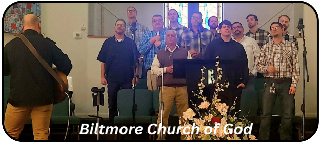
Thankful for the recent opportunity to share testimonies and worship with these wonderful congregations.