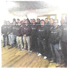
New TC sweatshirts