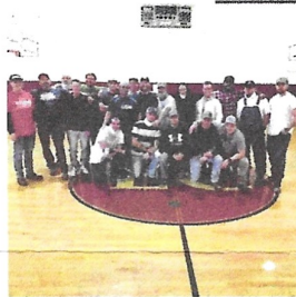
Helping Dream Center