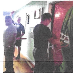
Deck the halls