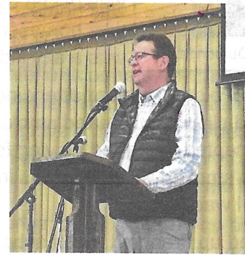
Senator Kevin Corbin