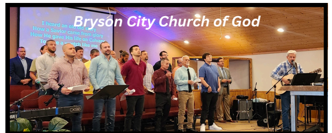
Bryson City Church of God

Thankful for the recent opportunity to share testimonies and worship with these wonderful congregations.