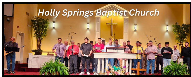
Holly Springs Baptist Church