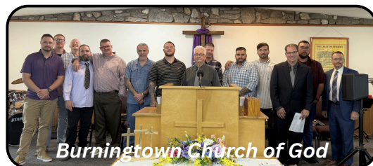
Burningtown Church of God