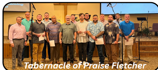
Tabernacle of Praise Fletcher

Thankful for the recent opportunities to share testimonies and worship.