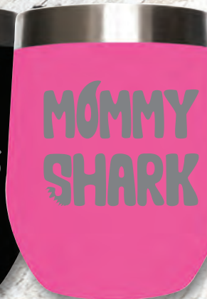
#6PMS 16oz $20