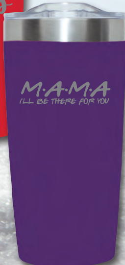
#2PMA 20oz $25