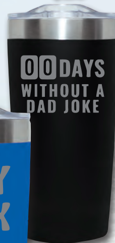
#2B00 20oz $25