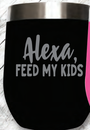
#6BAL 16oz $20