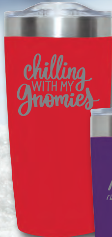
#2RCG 20oz $25