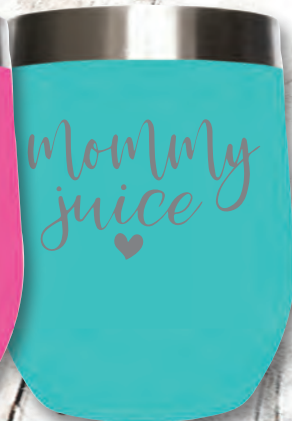
#6SMJ 16oz $20