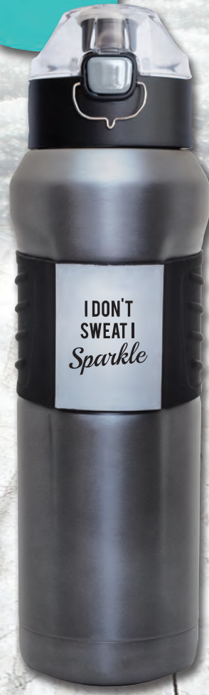
#HBSS 24oz $30