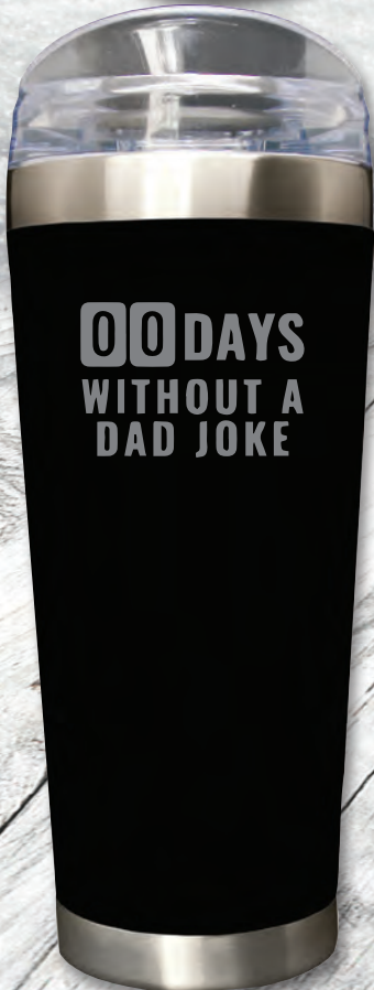
#8B00 28oz $35