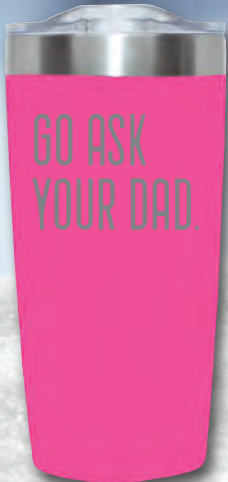
#2PGO 20oz $25