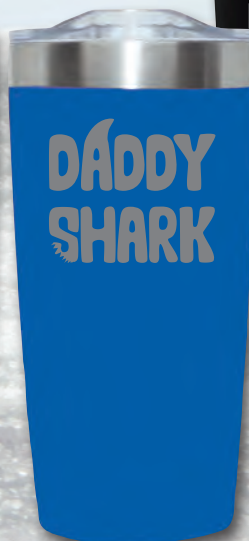
#2BDS 20oz $25