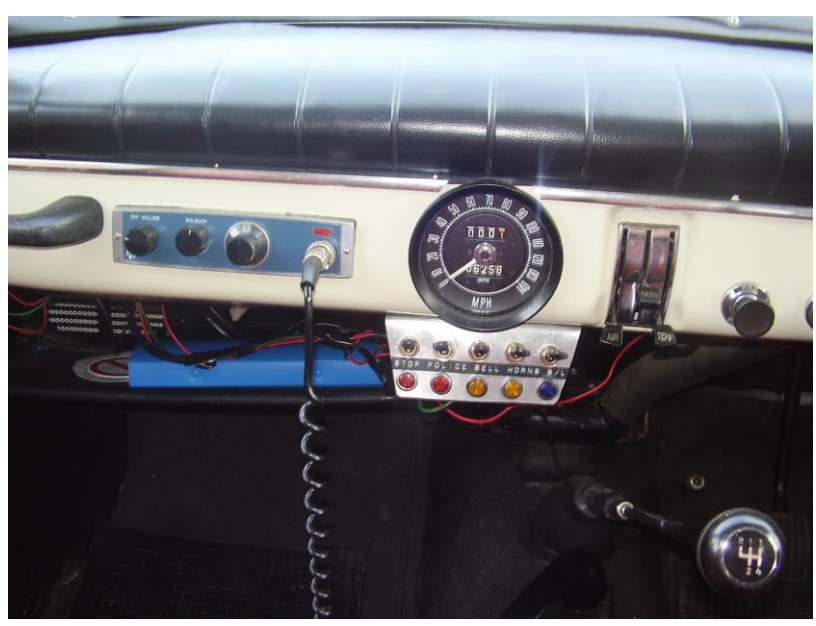
The new dash panel with Smiths calibrated speedo and all the necessary switch gear

In the meantime, I'd been doing quite a lot of research into the history of the car and discovered that it was purchased on the 1<sup>st</sup> May 1966 from Rex Neate Volvo dealership at Botley (the first three were supplied by Rex Neate with the last two supplied by Rudds of Southampton) and that it was based at Havant Police Station and had the call sign Juliet Zero One (J-01).