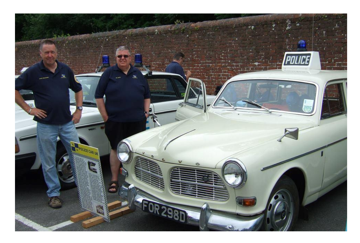
Families Day, Netley 2016 and J-01 is back on the road again

J-01's current estimated mileage is around 550,000 miles and is an ongoing project which I hope brings joy to all who see it.