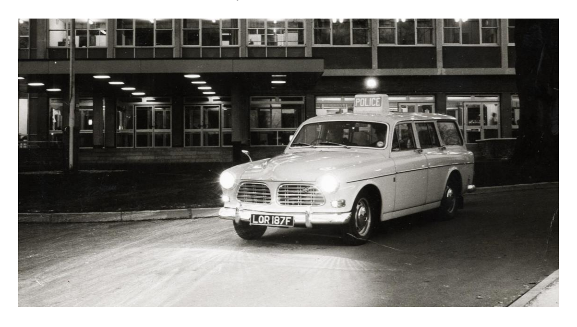
The fourth Volvo Amazon was this F registered car seen outside the front of HQ Winchester