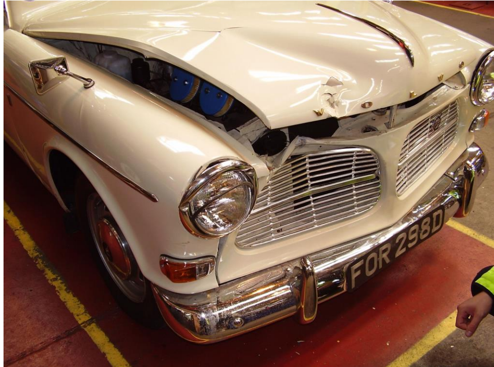
The huge amount of damage to the Volvo Amazon at Fareham Workshops

The Amazon needed a new bonnet, slam panel, front valance and grille. By some miracle that steel bar didn't touch any of the engine parts. It spent several more weeks being repaired and it all looked good once finished. And that new engine made such a huge difference to its performance. Which was good because I needed it for a very important photo shoot at Netley. 2005 marked 40 years since the Hampshire and Isle of