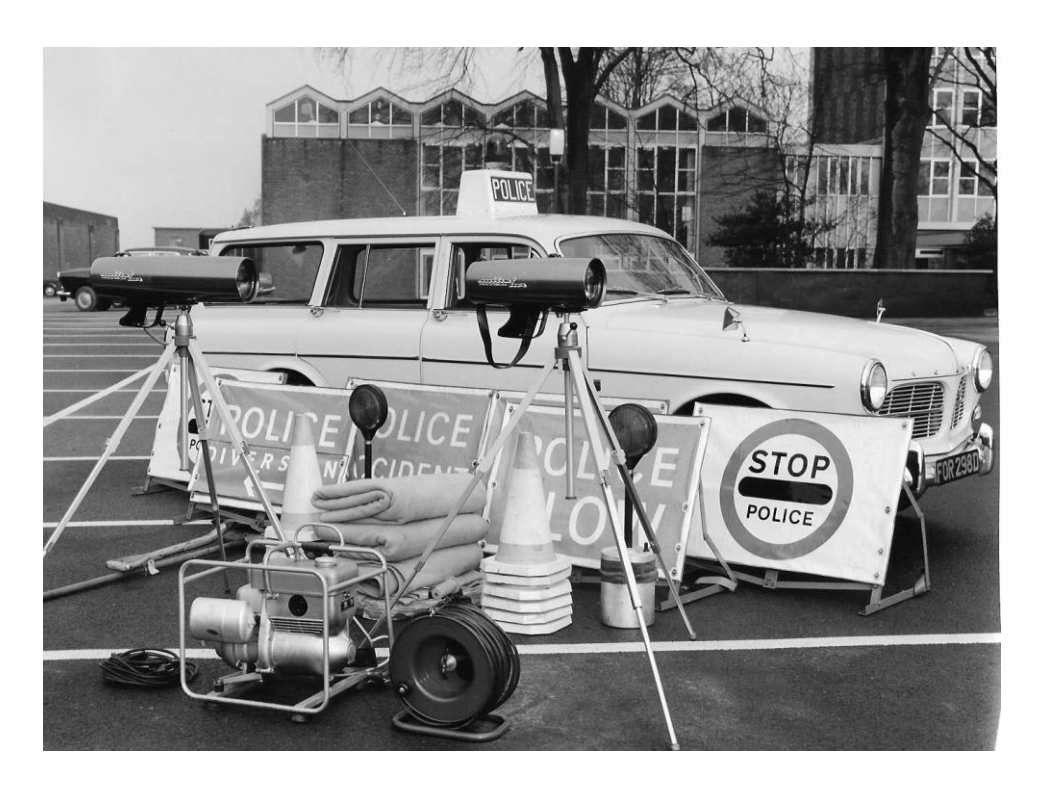
FOR 298D seen with all of its kit on display