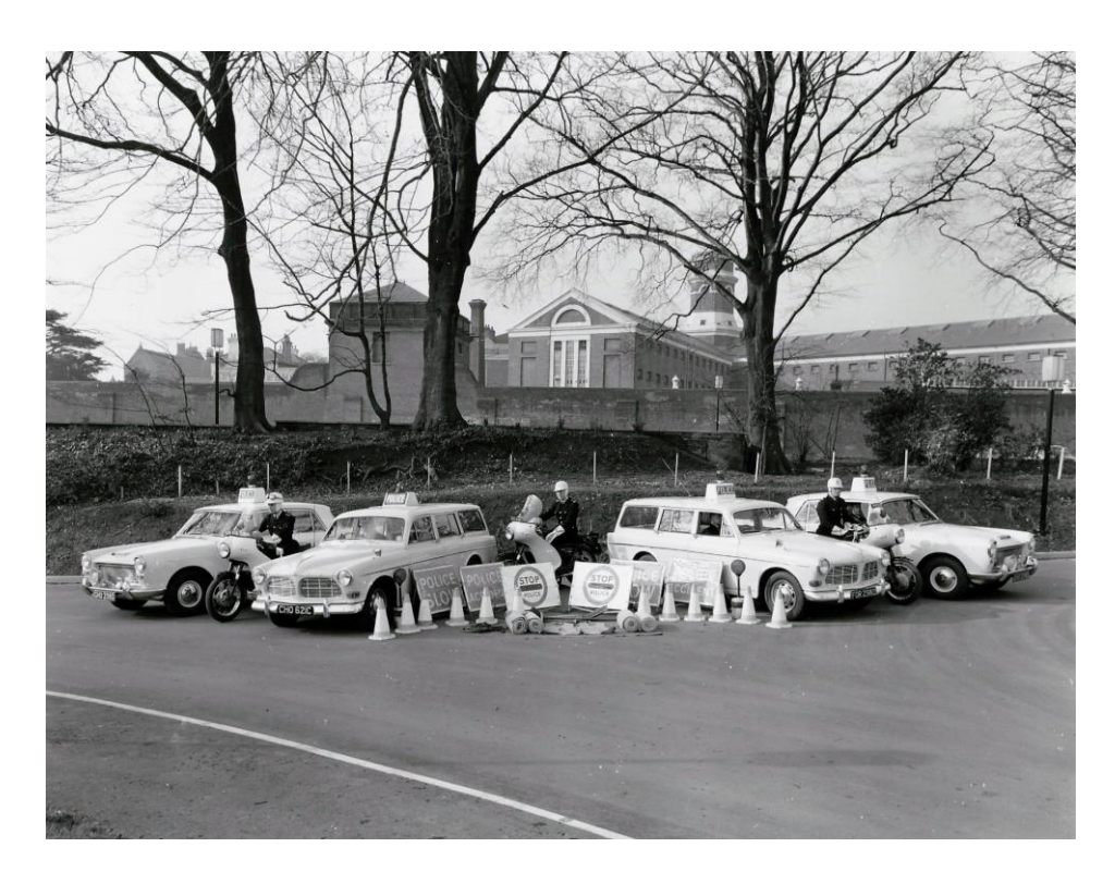
Both Volvos sit side by side with a couple of MK2 Austin A110 Westminsters and three Triumph 650 Saints