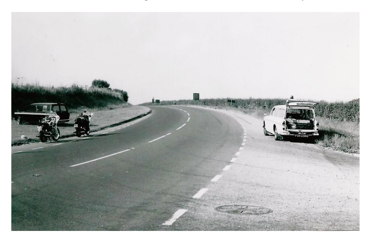
FOR 298D at the scene of a serious RTA on the A32 at West Meon

Over the next couple of years three more Volvo 121 estates were added to the fleet. LOR 187F and NCG 236F had larger 1986cc engines, uprated brakes and other improvements and were stationed at Basingstoke and Aldershot Traffic Sections respectively. Both these vehicles covered more than 140,000 miles in their lifetime. At the time of writing I don't have details of the fifth car but these early Volvos laid the foundation stones to a relationship that has now lasted, unbroken for 50 years.