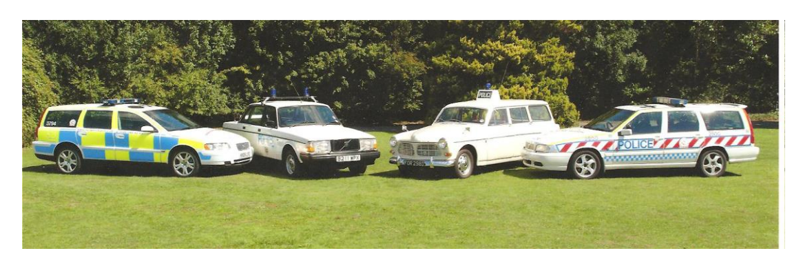
Hampshire Constabulary and Volvo cars 1965 to 2005