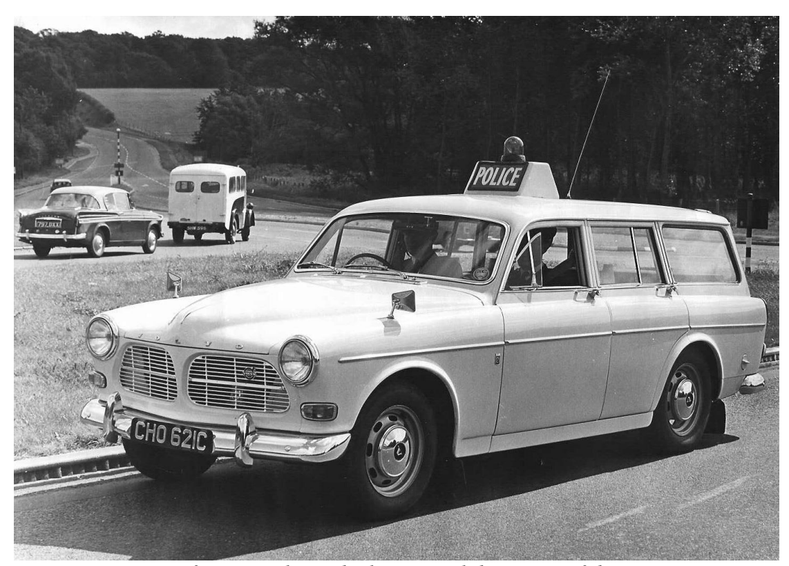
First foreign Police vehicle to patrol the streets of the UK

One of those photos was of CHO 621C, a 1965 Volvo 121 Amazon estate. I was hooked and had to learn more about this unusual looking car. I became even more enchanted when I discovered that it was the first foreign car ever used by a British Police force and slowly began to understand why the Hampshire and Isle of Wight Constabulary (as it was called then) had purchased it in the first place and why we, as a force had continued with what was then, a hugely controversial project. The more I learned the more I wanted to know and by the mid-1990s I had spoken to various people who had either driven these cars (there were 5 in total) or who had worked on them.