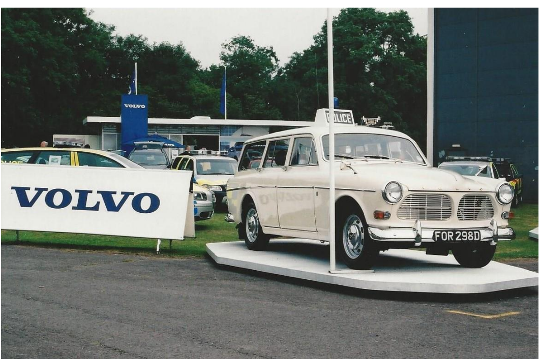
The two Hampshire Police Volvos on the Volvo stand at the 2005 National Association Police Fleet Managers Exhibition at Wroughton