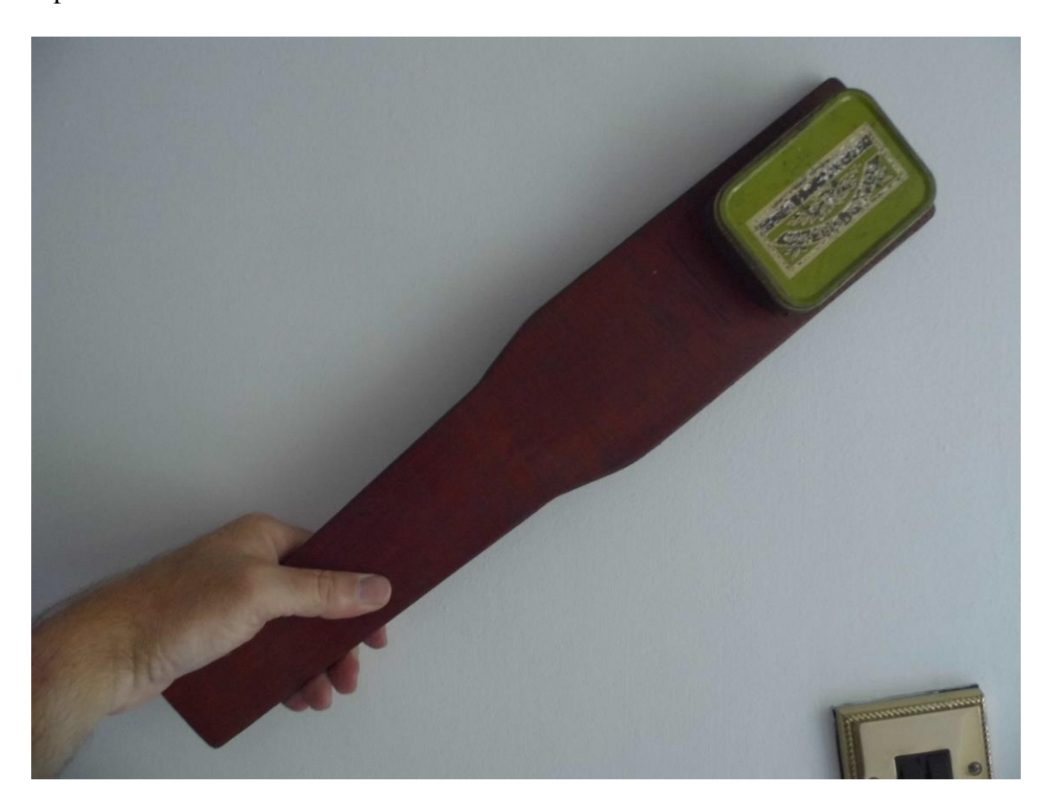
Essential ash tray was placed on top of the transmission tunnel

A rather sheepish officer then presented the Chief with an old Golden Virginia tobacco tin that was bolted to a 12-inch length of plywood, shaped like a boats oar that sat on top of the transmission tunnel in between the two front seats!