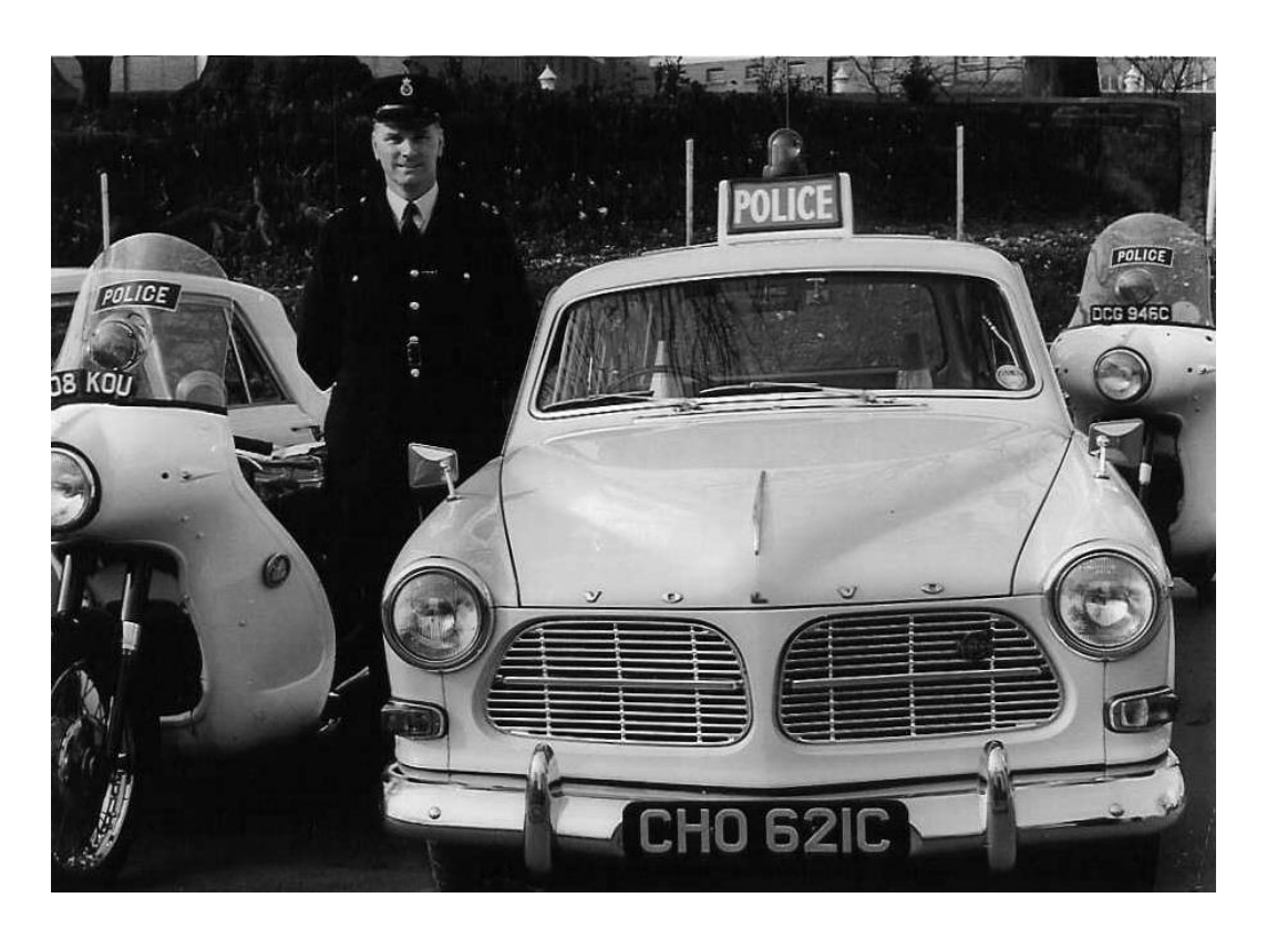
CHO 621C with one of its driver's PC Roy Foord