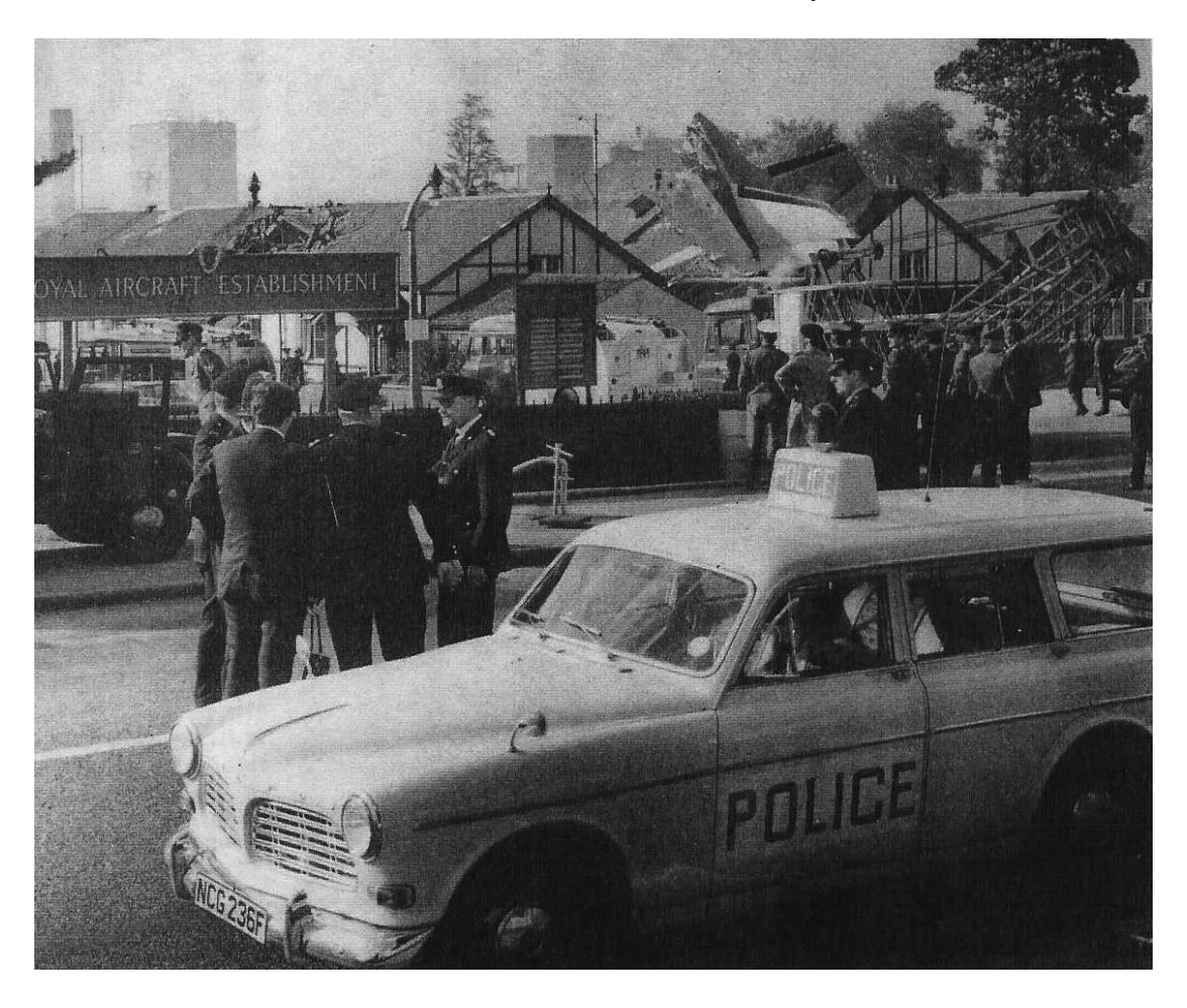
The fifth and final Amazon is seen here at the scene of a plane crash at Farnborough in 1970. The car now has POLICE labels on the front doors

The cars that followed the Amazon include the following; More than 90 Volvo 144DL saloons, including the big bumper model were purchased by Hampshire Constabulary and no fewer than 350 of the 200 series from 1975 to 1992. This included the 244DL with its 2.1 litre engine, the 244 GLT with the up-rated 2.3i engine, the 240 Police Special (built to Swedish Polis spec) and the 240 GL model. The force also had two Volvo 264DL saloons, with 2.7 litre V6 engines and a manual gear box (very unusual) to try and combat the threat from BMW. A single batch of eight 360 GLEi saloons were purchased as urban area cars and in 1994 came the famous T5 range with first the 850T5 saloons, then the 850T5 estates (which were automatics) followed by the 1997 model V70T5 and then the bigger 2000 model V70T5. Currently (2016) the force operates a number of Volvo XC70 D5 estates as ARVs. In between all these the force has also trialled the 740 Turbo, 460, 960, S40, V40 and more recently the V60 D5.