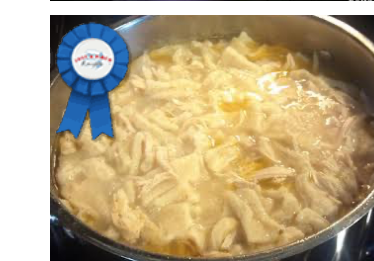
Old Fashioned Homemade Chicken & Dumplings