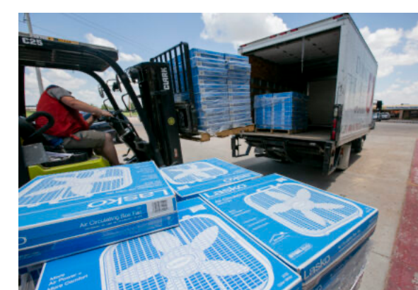
Annual fan drive benefits Salvation Army