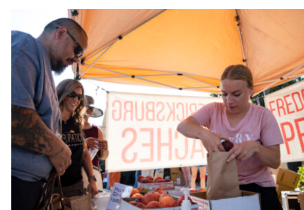
Parks Legado Farmers Market