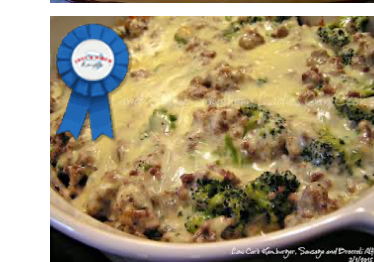
Hamburger, Sausage, Broccoli Alfredo - Low Carb