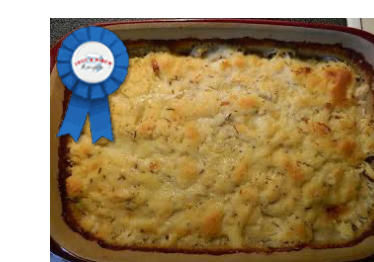
Baked Chicken and Dumplings