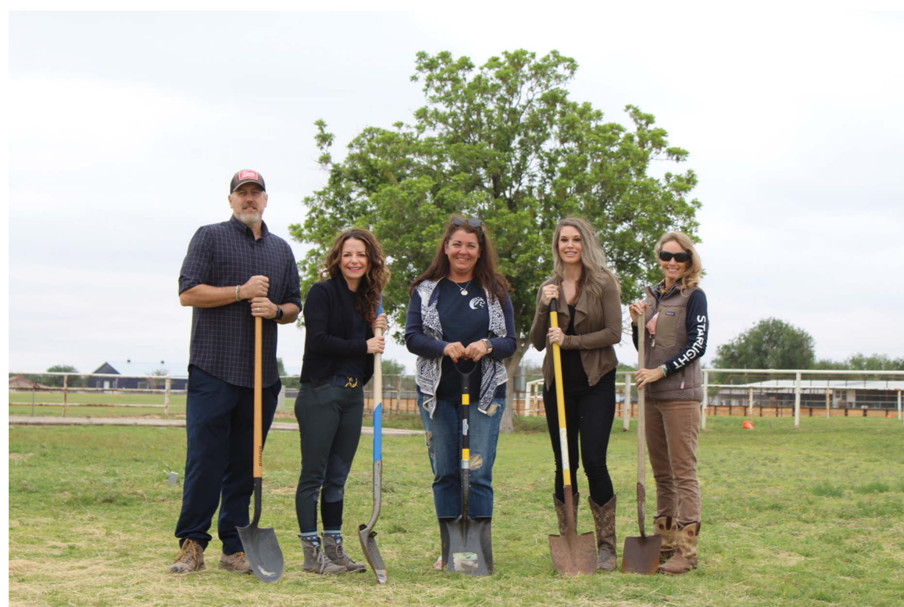
Starlight Therapeutic Riding Center in Midland recently held a ground-breaking ceremony to commemorate the construction of a new indoor riding arena and sensory trail. The center's mission is to improve the mental health, physical ability, and cognitive skills of people living with disabilities.

MIDLAND The elements will no longer keep Starlight Therapeutic Riding Center from fulfilling its mission to improve the mental health, physical ability, and cognitive skills of people living with disabilities.