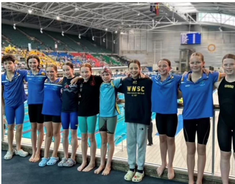
Some of our SISA 2025 Junior Swimmers at Junior State Age