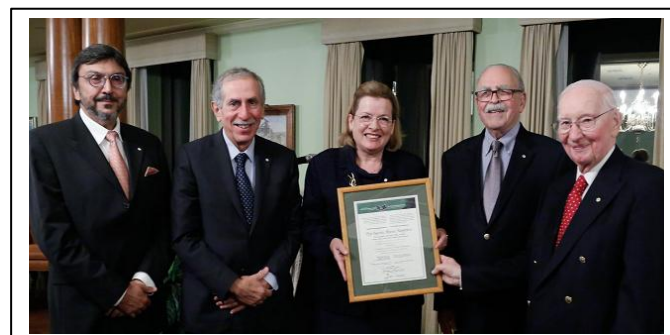
2019 Friesen Prize Award Presentation to