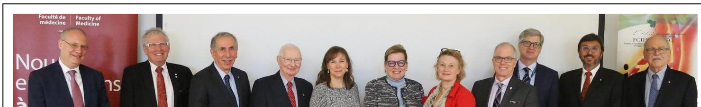
2019 FCIHR Roundtable at U Ottawa – September 19, 2019 – “Impacts of Disruptive New Technologies on Society: Role of the Academy”