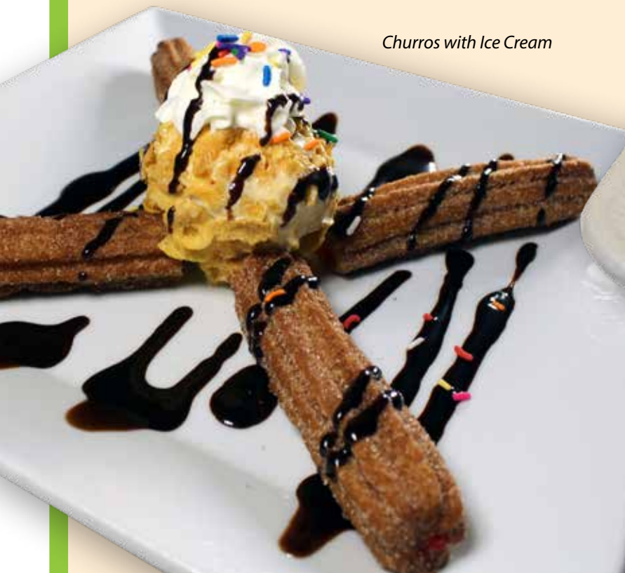
Churros with Ice Cream

Banana Split | Fresh banana split with ice cream. Topped with whipped cream, swirl chocolate syrup and sprinkles | $6.75