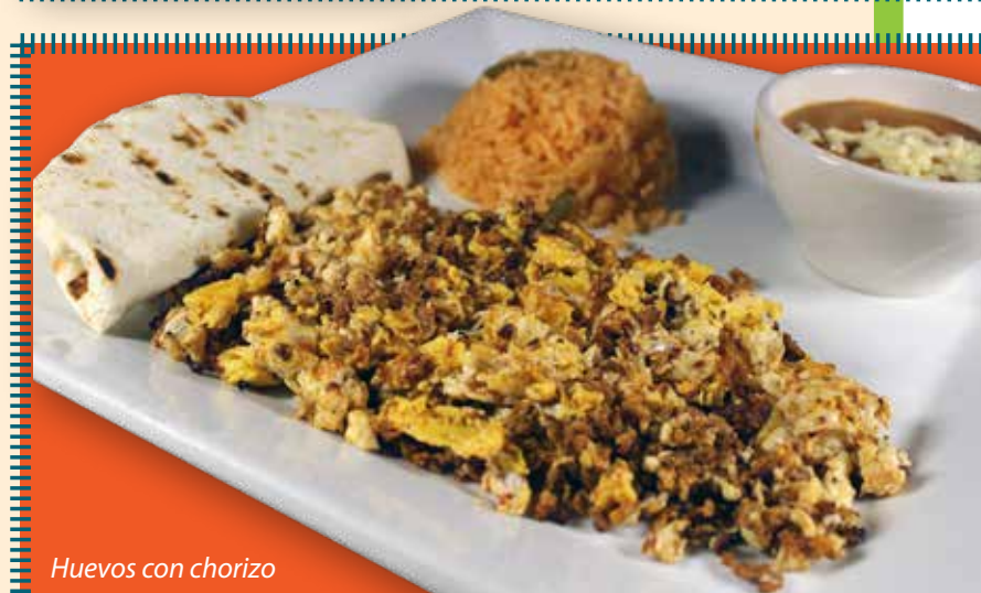
Huevos con chorizo

Menu prices have a 3.75% cash adjustment discount built into all pricing. Any purchase made with a credit/debit card will not receive this discount.