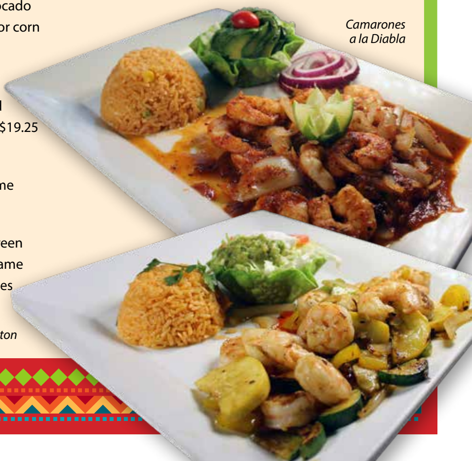
Camarones a la Diabla

Utica's Veggie Burrito | A rolled flour tortilla, grilled vegetables, green bell peppers, onions, tomatoes, mushrooms, zucchini, squash, topped with cheese sauce. Served with lettuce, diced tomatoes, and rice | $13.25