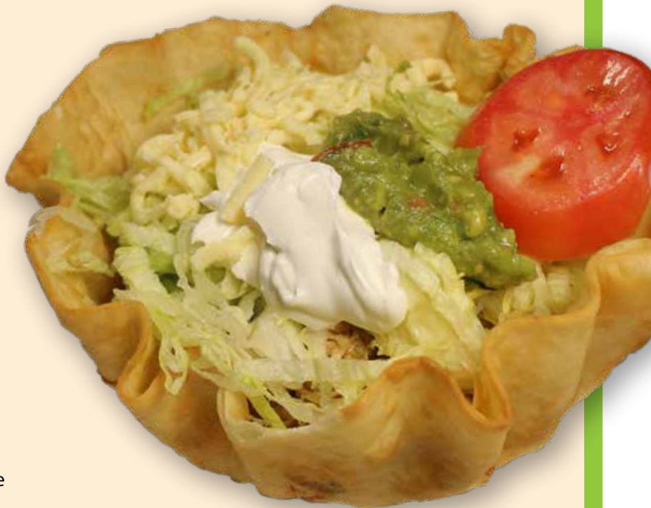
Taco Salad Pollo

Grilled Chicken Salad | A bed of lettuce with grilled chicken, marinated fresh onions, green bell pepper, sliced tomatoes, and house dressing | $11.00