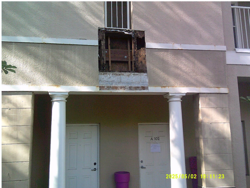
2. Additional area exposed during the phase 2 process, indicating water-damaged studs and OSB sheathing.