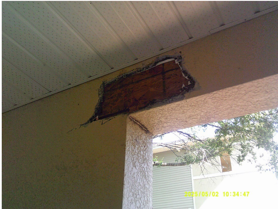
8. Close-up of the exposed area at Unit F101. (refer to photograph 65 in the phase 1 report)