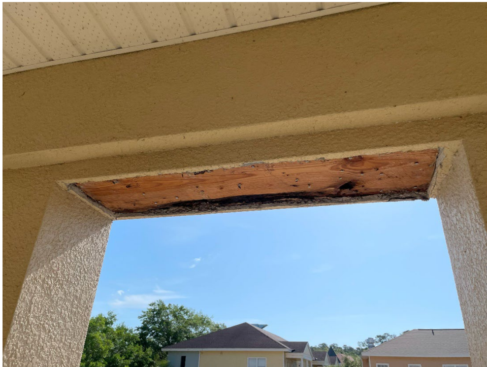
12. View of water-damaged sheathing at G302 and G303 . (refer to photograph 73 in phase 1 report).