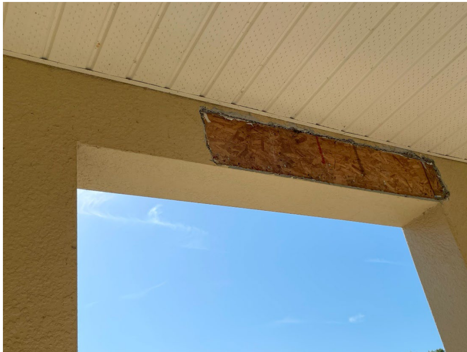
10. Close-up of the exposed area at Unit G201. (refer to photograph 77 in phase 1 report)