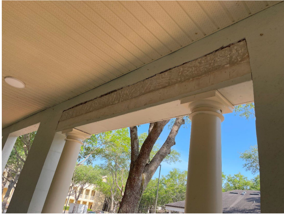
11. Close up of the exposed area at Unit F101. (refer to photograph 65 in phase 1 report)