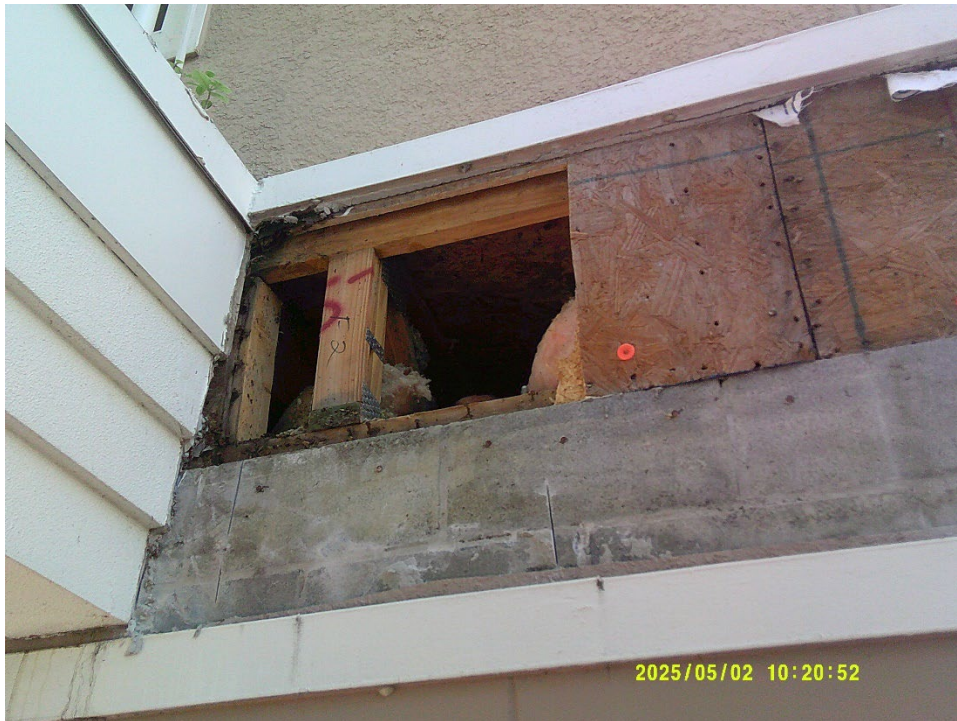
6. Close-up of the exposed area in the previous photograph. (Refer to photograph 52 in the phase 1 report).