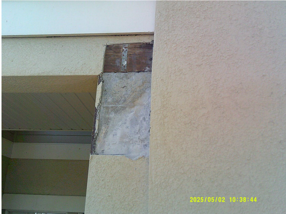
7. Close-up of the exposed area at Unit F103. (Refer to photograph 64 in the phase 1 report).