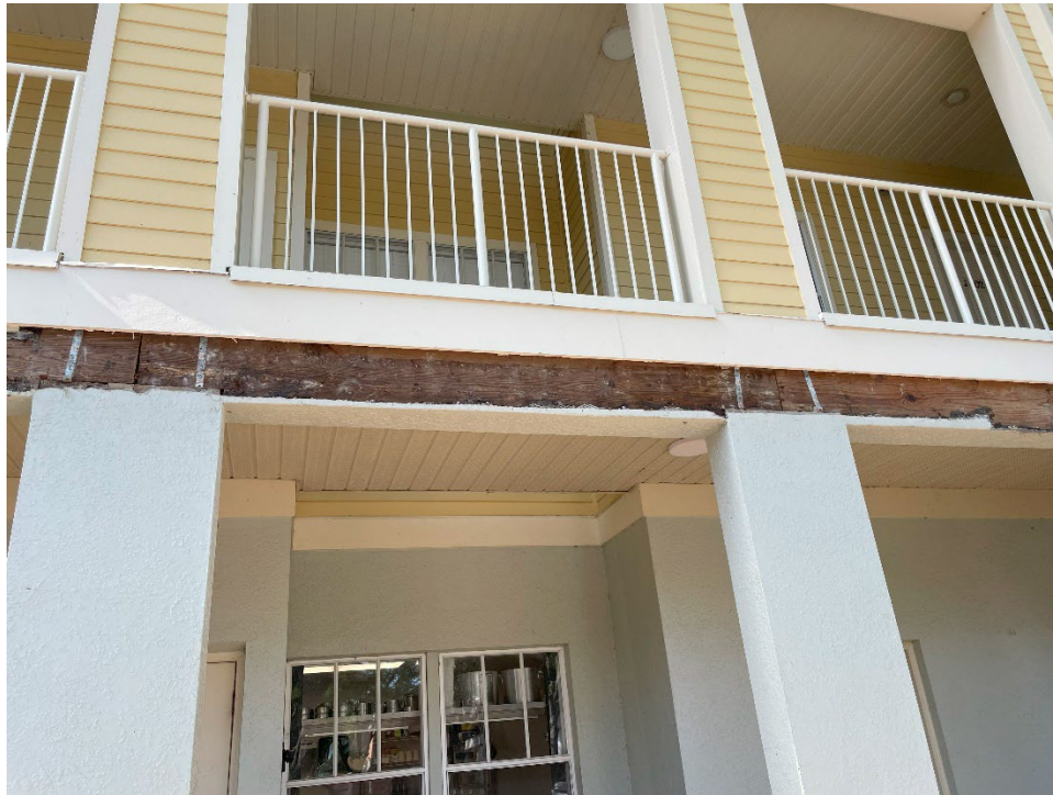
13. Close up of the exposed area at Unit J201. (refer to photograph 105 in phase 1 report)