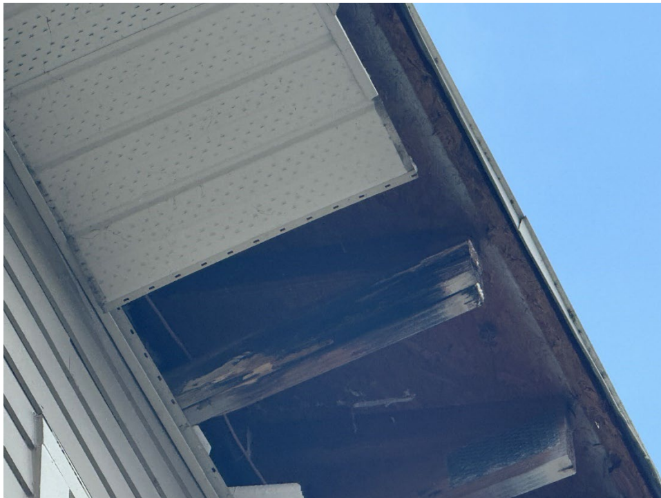
14. An additional soffit was exposed at Building K, which indicated a water damaged truss.