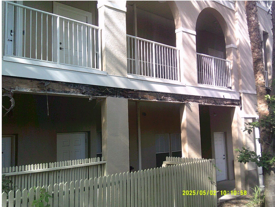
1. View of the exposed compromised beam at A101-A02 (refer to photograph 19 in the phase 1 report)