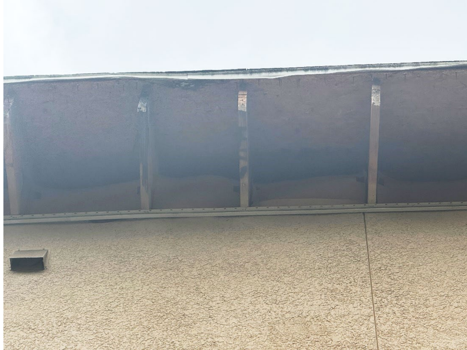
6. View of the minor water damage at the end of a wood truss at Building D. (Refer to photograph 53 in the phase 1 report.)