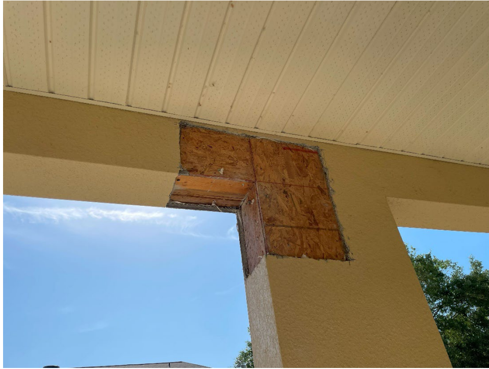
9. Close-up of the exposed area at Unit G204. (refer to photograph 76 in phase 1 report)