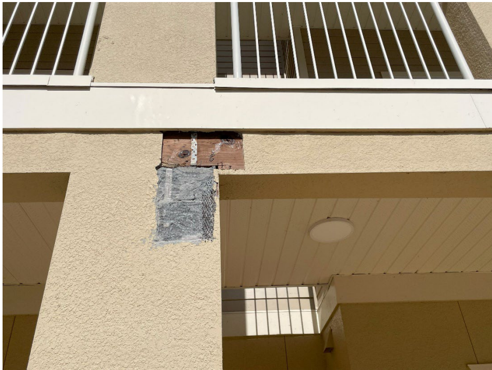
9. Close up of the exposed area near units G102 and G104. (Refer to photograph 72 in phase 1 report).