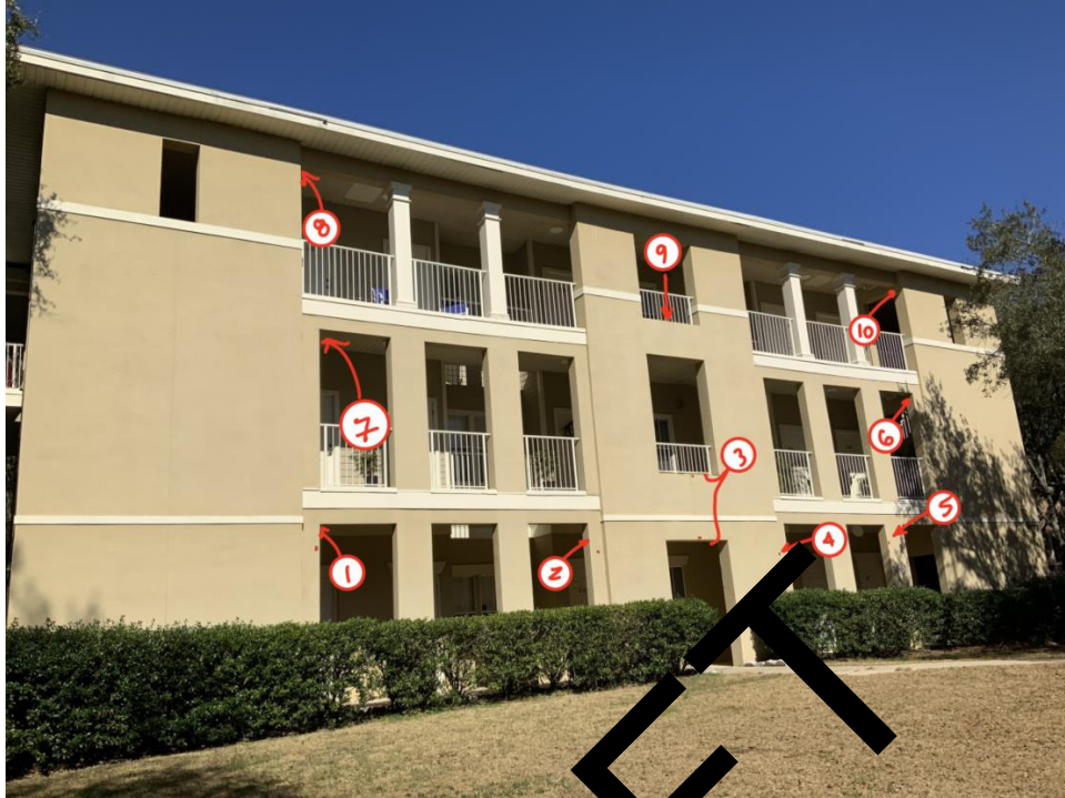
Elevation 9: View of the south elevation of Building E.