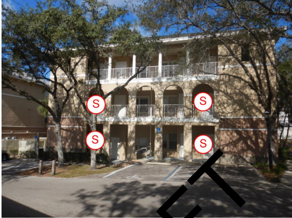
Shoring 5: View of shoring locations along the north elevation of building C.