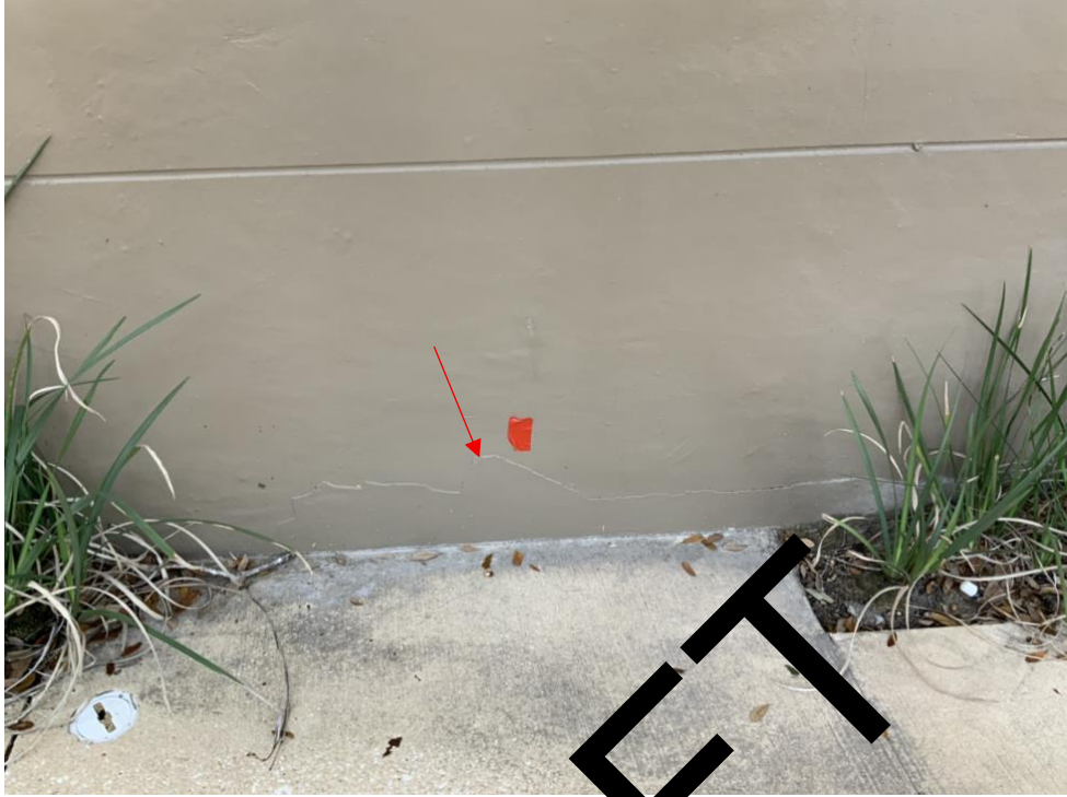
Photograph 9: View of a portion of cracked exterior wall finish along the north elevation of Building L.