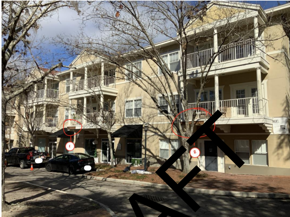
Elevation 1: View of the south elevation of Building A.