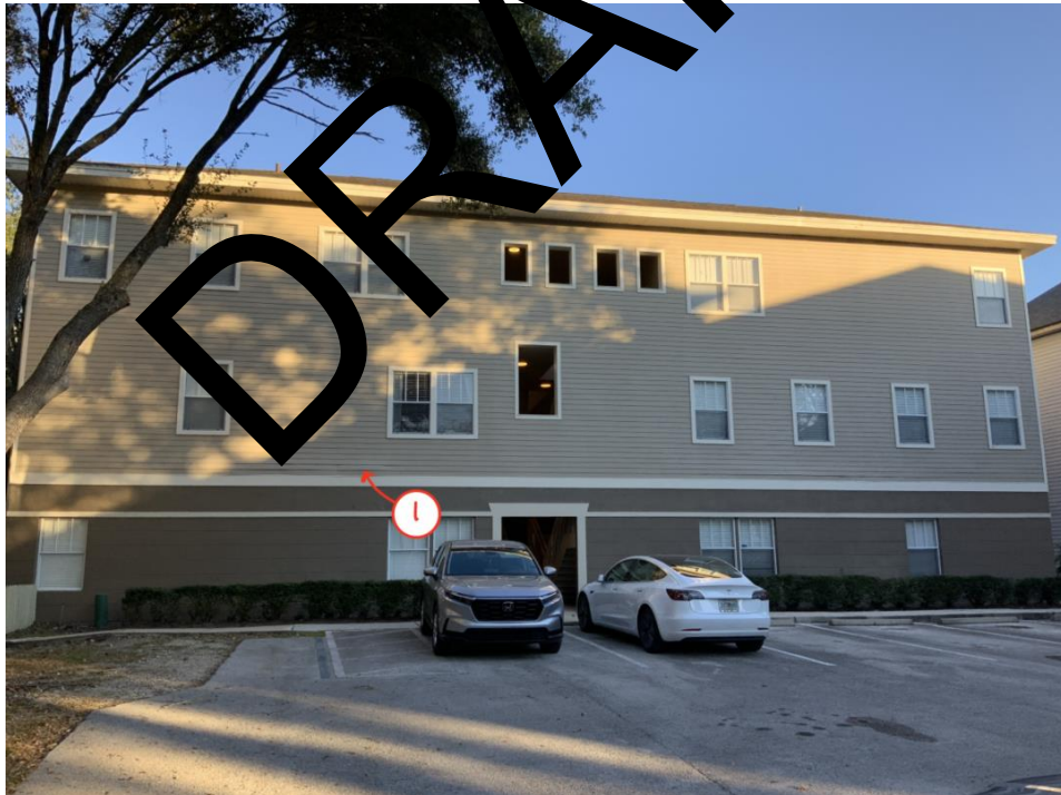
Elevation 16: View of the west elevation of Building K.