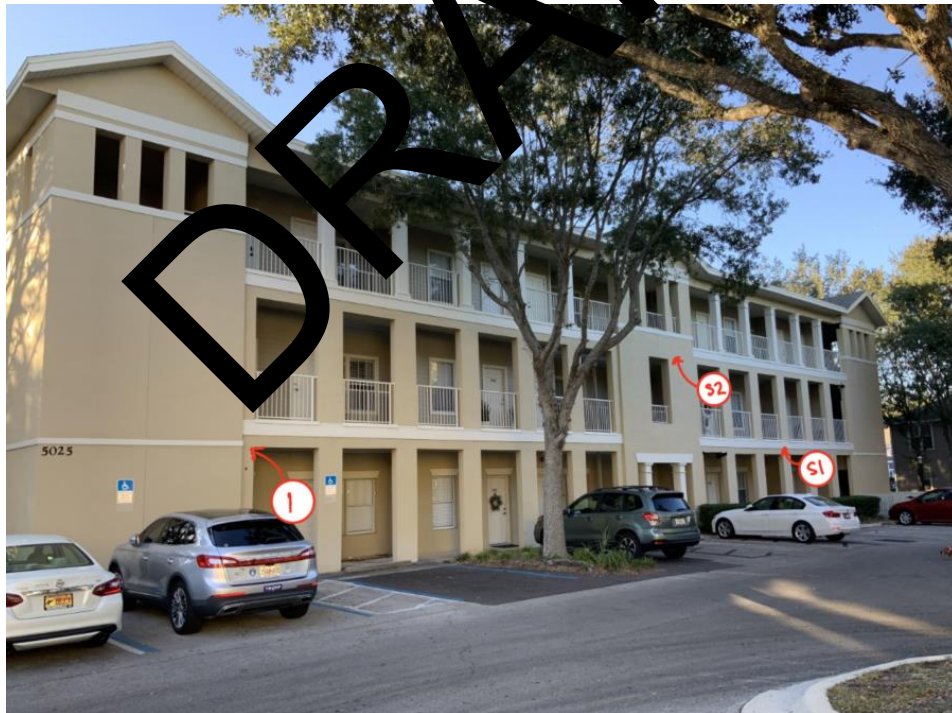
Elevation 12: View of the east elevation of Building H.