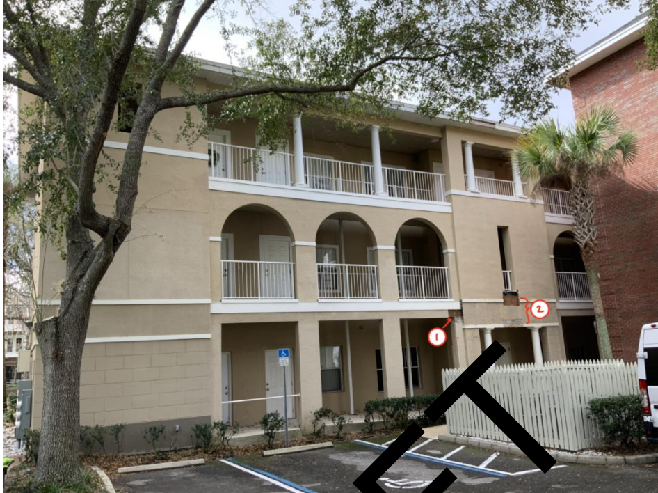
Elevation 5: View of the north elevation of Building B (East portion).