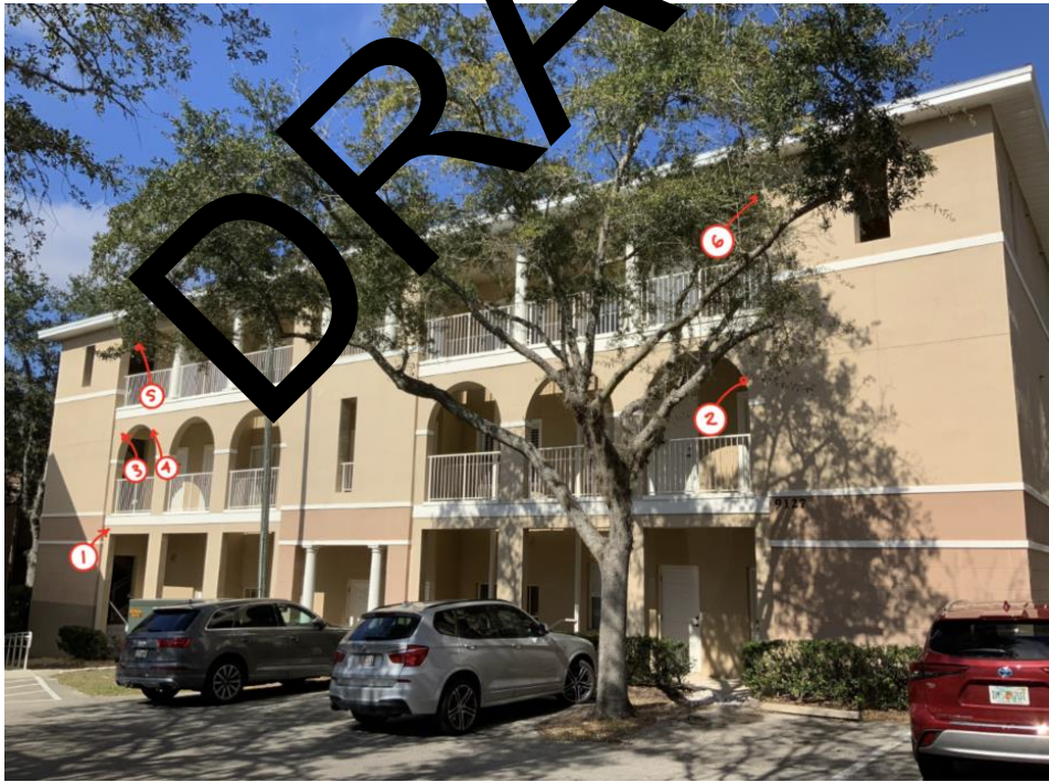
Elevation 8: View of the south elevation of Building D.