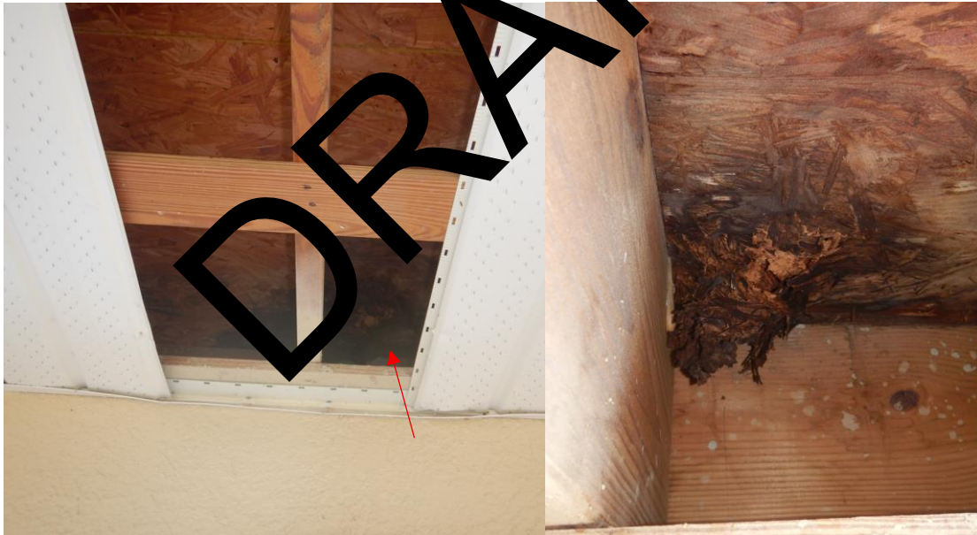
Photograph 6: View of stained and deteriorated wood decking above the north breezeway on the first floor of Building G.