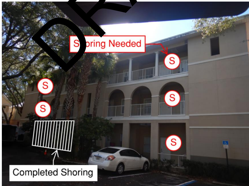
Shoring 2: View of shoring locations along the north elevation of building A.