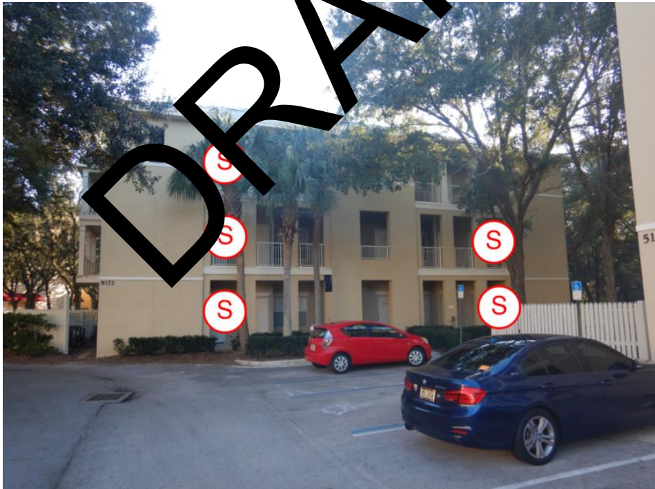
Shoring 8: View of shoring locations along the north elevation of building F.