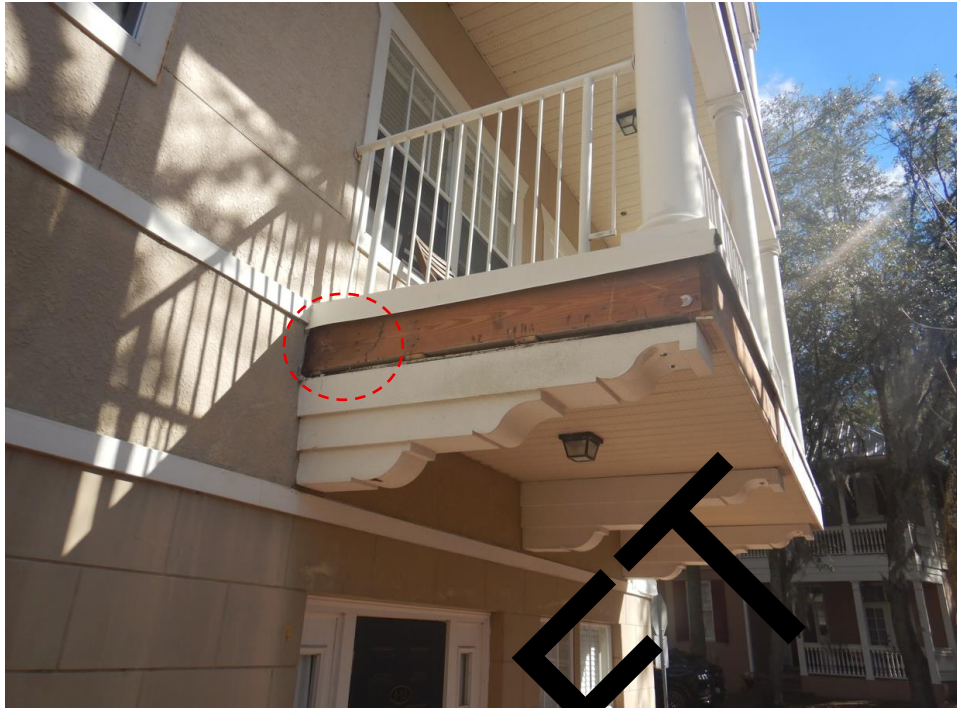
Photograph 1: View of a portion of stained fascia board along the east balcony along the second floor balcony of Building A.