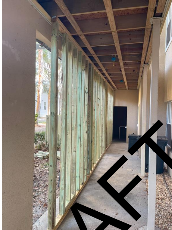
Shoring 1: View of a portion of completed shoring along the north elevation of Building A.