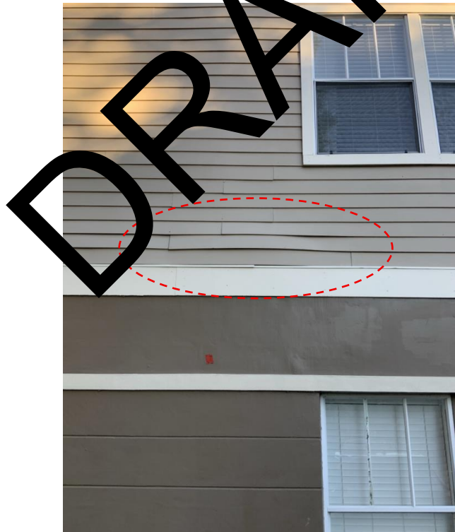
Photograph 8: View of bulging siding along the west elevation of Building K.