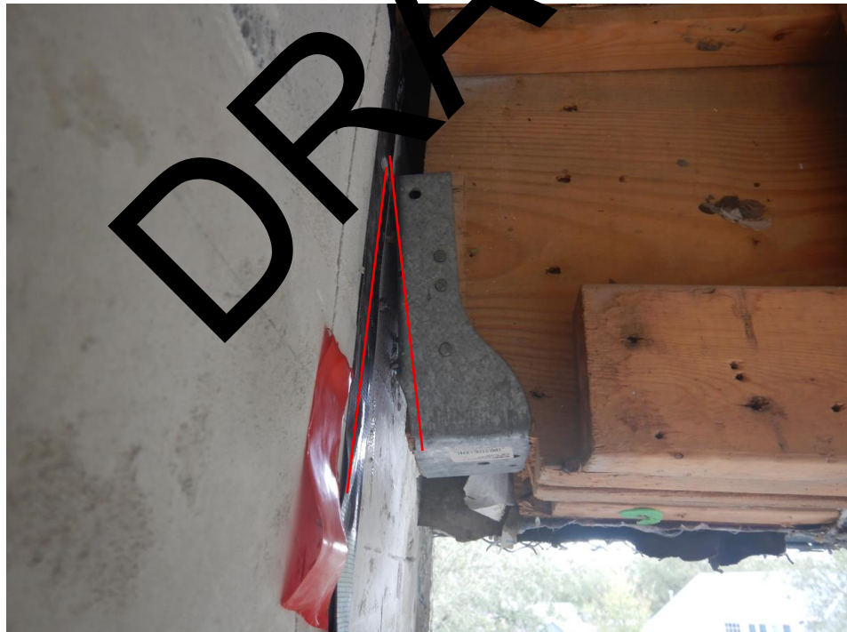
Photograph 2: View of separation between the north breezeway beam and CMU block on the third floor of Building A.