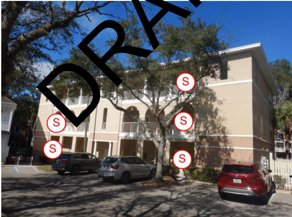
Shoring 6: View of shoring locations along the south elevation of building D.