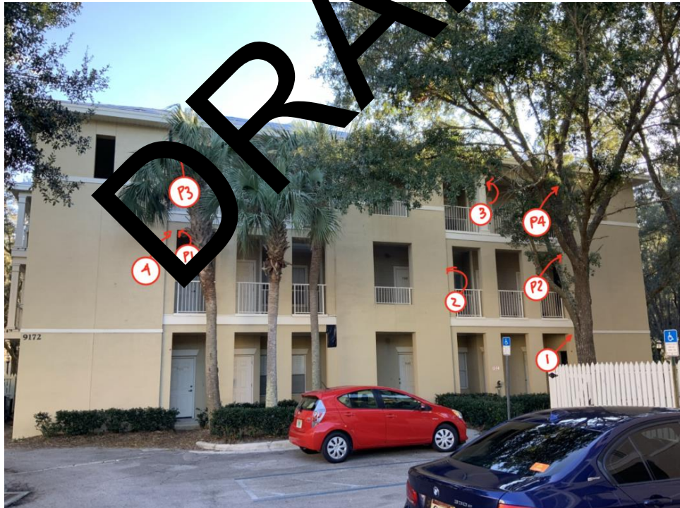
Elevation 10: View of the north elevation of Building F.