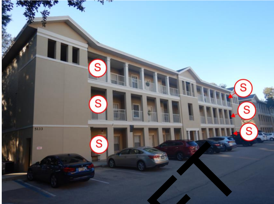
Shoring 9: View of shoring locations along the west elevation of building G.