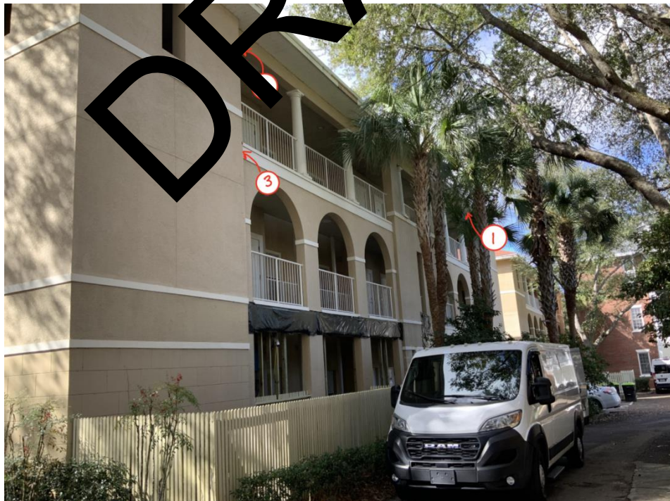
Elevation 2: View of the north elevation of Building A.