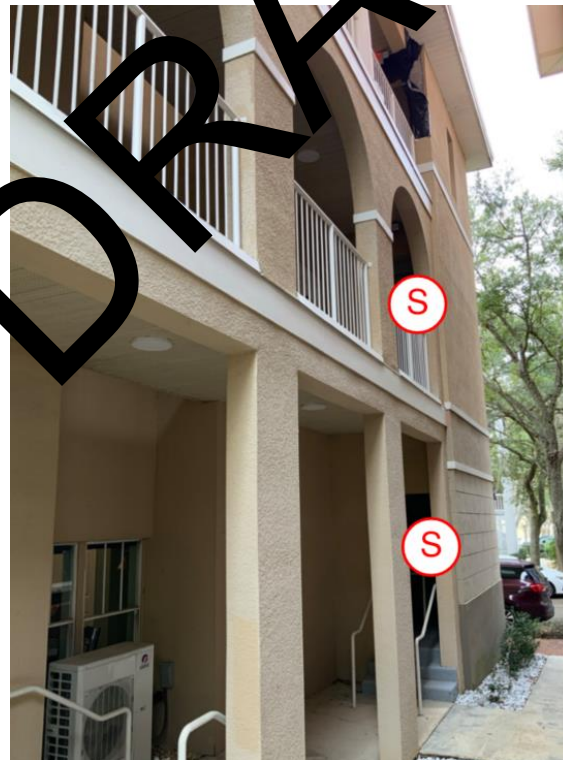
Shoring 4: View of shoring locations along the north elevation of building B.