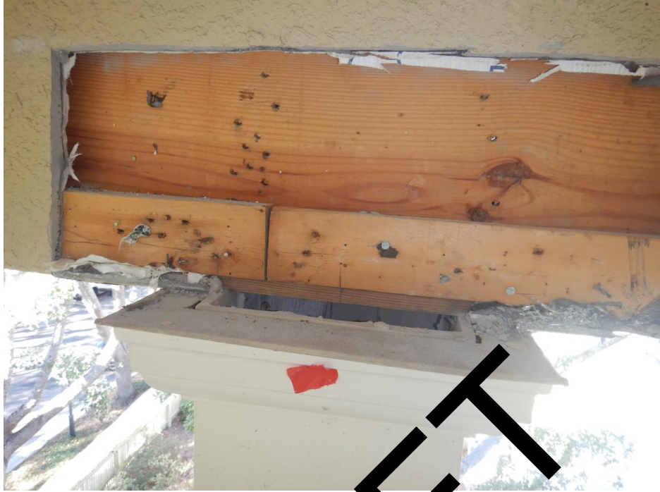
Photograph 5: View of a hollow column below the west breezeway beam on the third floor of Building F.