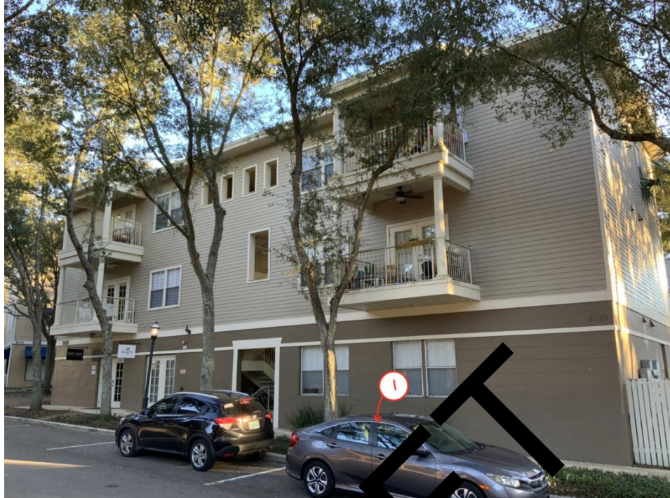
Elevation 17: View of the north elevation of Building L.