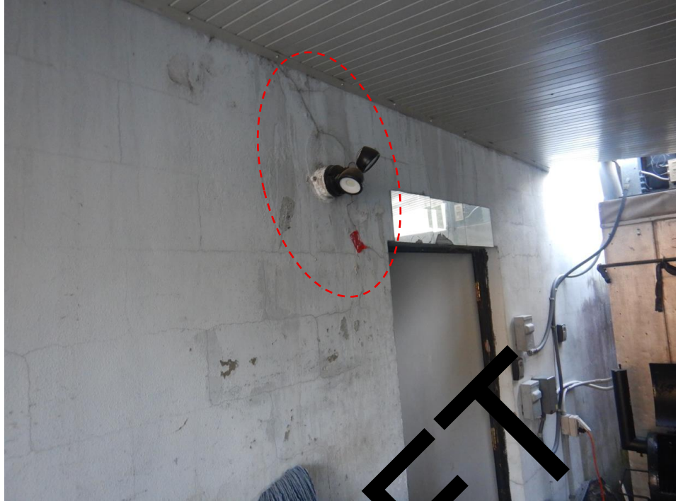
Photograph 7: View of cracked exterior wall finish along the south wall of Building I.