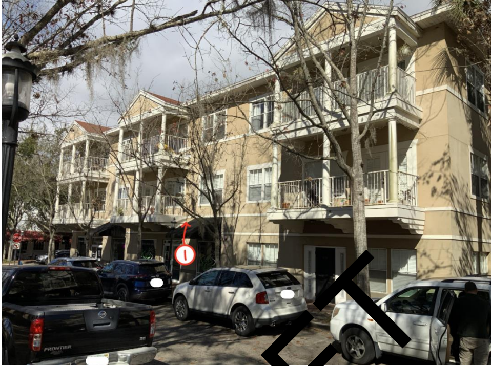
Elevation 3: View of the south elevation of Building B.