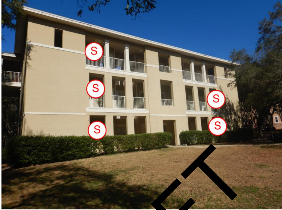
Shoring 7: View of shoring locations along the south elevation of building E.