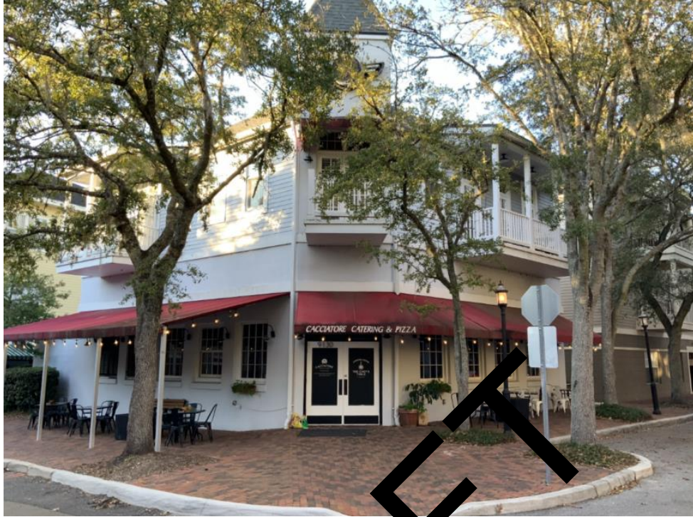
Elevation 13: View of the south and east elevations of Building I (No marked locations).