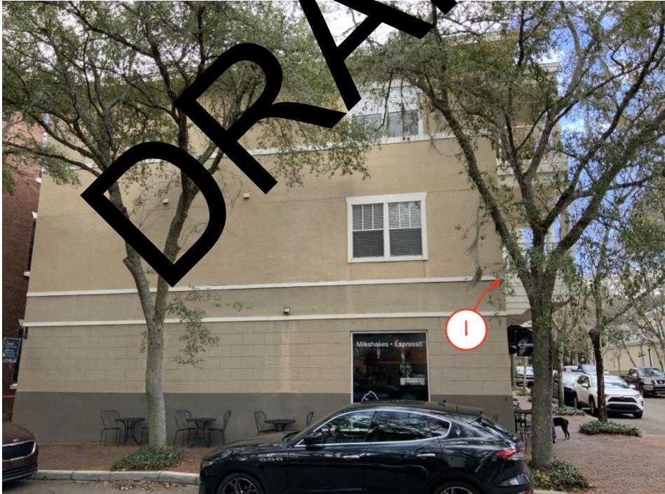
Elevation 4: View of the west elevation of Building B.