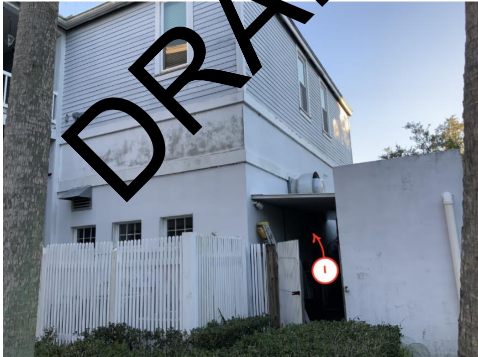
Elevation 14: View of the north and west elevations of Building I.