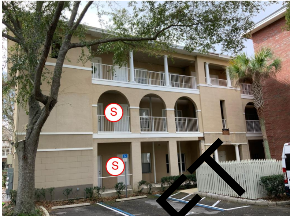
Shoring 3: View of shoring locations along the north elevation of building B.