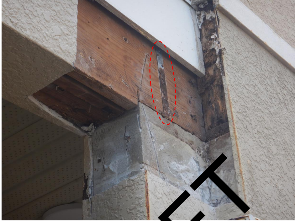
Photograph 3: View of a strap connection between the south breezeway beam and the CMU column on the first floor of Building B.