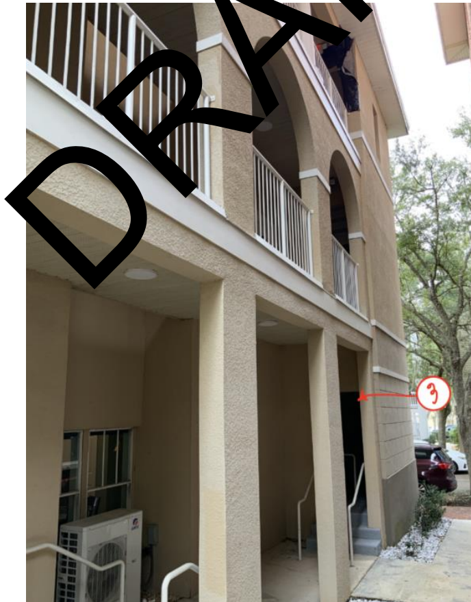
Elevation 6: View of the north elevation of Building B (West portion).