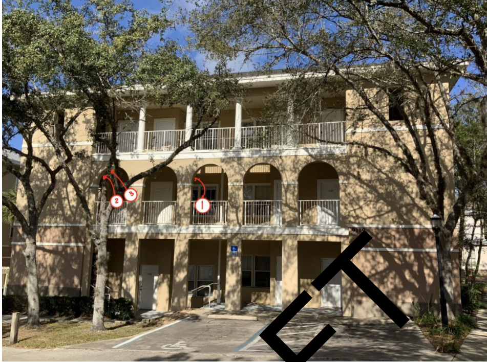
Elevation 7: View of the south elevation of Building C.