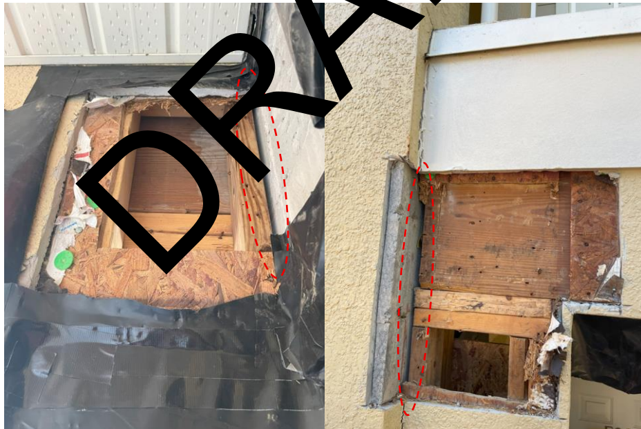
Photograph 4: View of no connection between the east breezeway beam and the CMU block on the second floor of Building F.