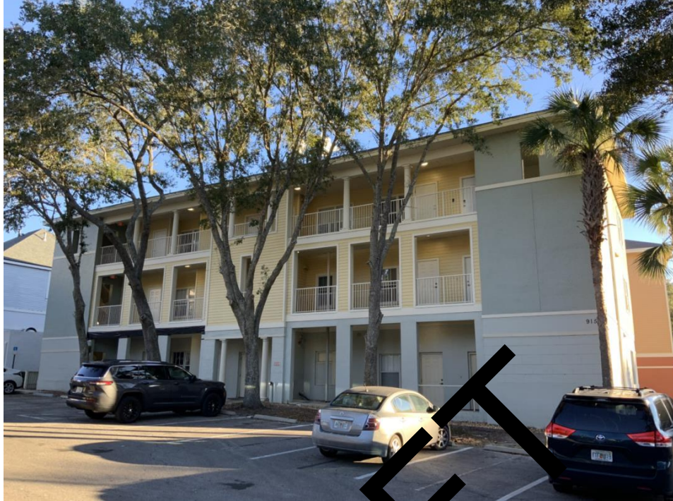
Elevation 15: View of the north elevation of Building J (No marked locations).