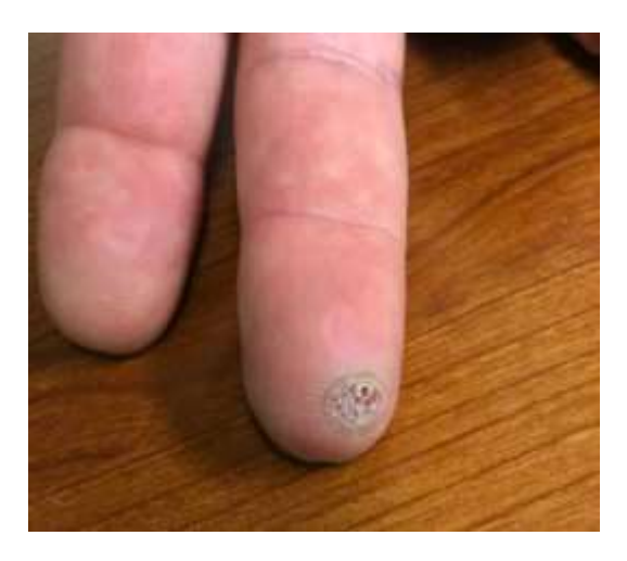
Figure 1: Photograph of right third finger

It is estimated that 1.3-3% of renal carcinomas have cutaneous metastasis,<sup>1</sup> with the majority presenting on the scalp.<sup>2</sup> Metastasis affecting the hand is reported to occur in 0.1% of RCC cases.<sup>1</sup> The lesions may appear vascular and mimic benign lesions such as pyogenic granuloma (PG).<sup>2-4</sup> In our case, the histological findings using low power magnification might suggest PG and using high power magnification papillary RCC (pRCC). Immunohistochemical staining differentiates between ccRCCs and pRCCs. Although AMACAR positivity is more associated with pRCC, the absence of CK7 expression supported clear cell origin.<sup>5-8</sup>