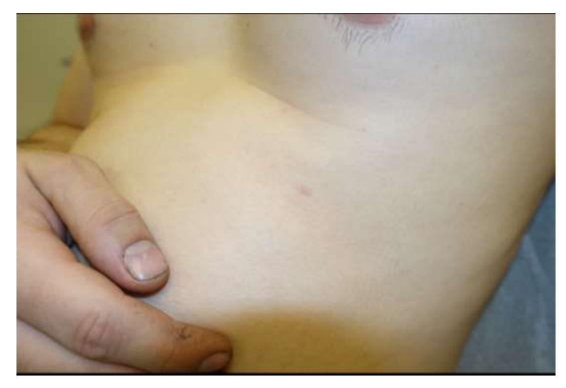
Figure 1: Small, tender, indurated, flesh-colored papule on the left upper abdomen.