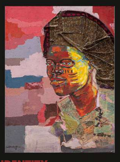
IDENTITY Medium: Mixed Media Year: 2017 Price: £500