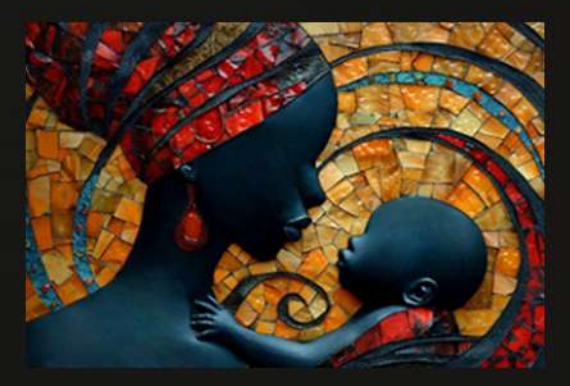
Name: Faceless Emotion Medium: Digital Art (ubism) Size: 60cm x 108cm 2024 £200