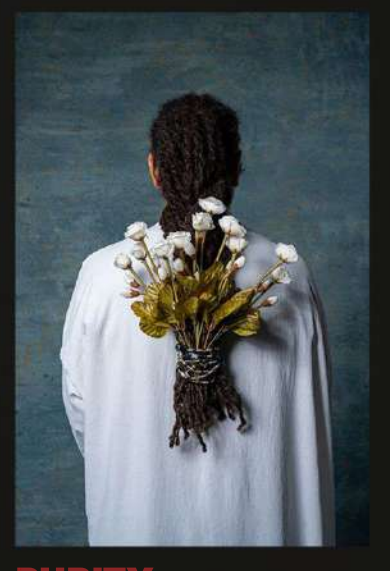
PURITY Medium: Photography Year: 2024 Price: £400