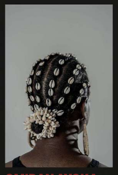
OMIDAN AYOKA Medium: Photography Year: 2023 Price: £400

continues to captivate audiences with her evocative artwork, each piece serving as a testament to the timeless allure of African artistry and the enduring spirit of its people.