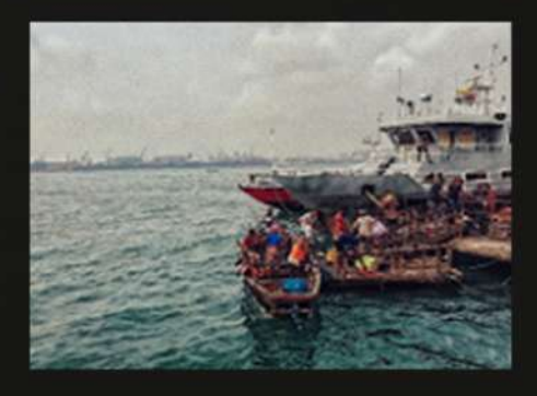
Ona Omi L'eko Size: 16 x 20 Medium: Photography Year: 2022 Price: £700