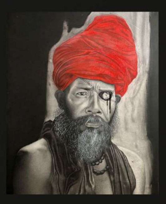
Global Discord Medium: Paint, charcoal, and pencil on canvas Year: 2024 Price: £350

In The Midst Medium: Paint, charcoal, and pencil on canvas Year: Price: £350