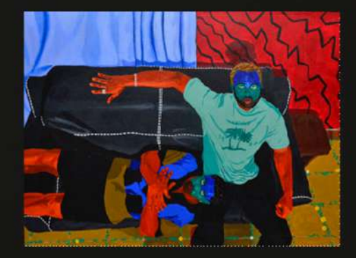
Saturday Couch Therapy (print) Acrylic on Canvas 36 x 48 Inches 2024. £250

Why we can't cry (print) Acrylic on Canvas 3 x 4 feet 2024 £200