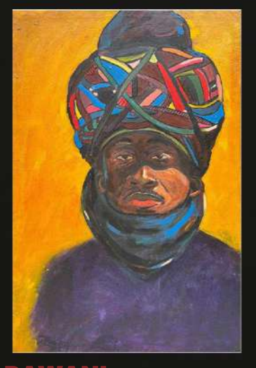
RAWANI Medium: Acrylic on canvas Print Year: 2022 Price: £500

The brilliance of Ifeoluwa's work has attracted attention on a global scale. His art has been featured prominently by renowned news outlets such as BBC, CNN, Reuters, Voice of Africa, TV5 Monde, Channels, Vanguard newspaper, BusinessDay newspaper, Yahoo and more.