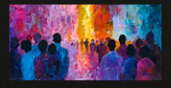
Name: Judgement Day Medium: Digital Art Size: 58cm x 108cm 2024 £200

Tosin Iwayemi's artistic vision is a testament to the transformative power of storytelling. Through his lens and digital canvases, he invites audiences to join him on a captivating exploration of Africa's history, traditions, cultures, beliefs, and values, transcending borders and fostering a deeper appreciation for the continent's rich tapestry.