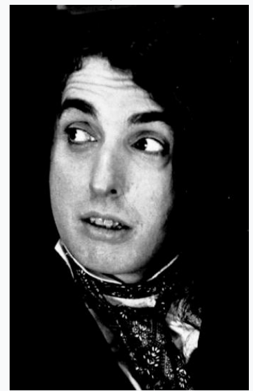
Khaury in 1971

Tiny Tim performed as a singer and guitar/ukulele player in 1960s Greenwich Village before making guest appearances on Laugh-In and The Ed Sullivan Show . Known for his distinctive falsetto, he had a hit with his remake of “Tip-Toe Through the Tulips With Me.” His wedding to his fiancée Miss Vicki on The Tonight Show also drew the most viewers in the show’s history. He died on November 30, 1996.