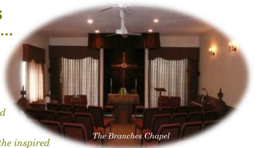
The Branches Chapel

We are a member congregation of the Anglican Church in North America and the Diocese of Western Anglicans.