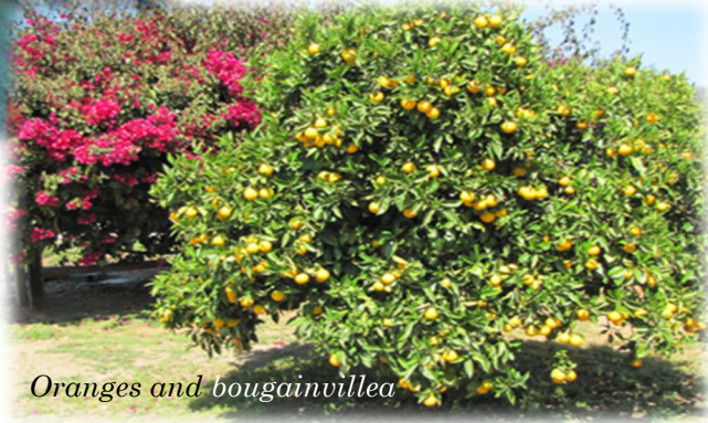
Oranges and bougainvillea

Years before Branches of the Cross was founded, God assembled what is literally a million dollar property, a property we could never dream of buying, and planted our church.