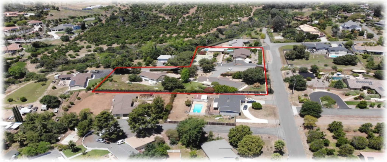
Aerial View, Branches of the Cross Campus and surroundings.