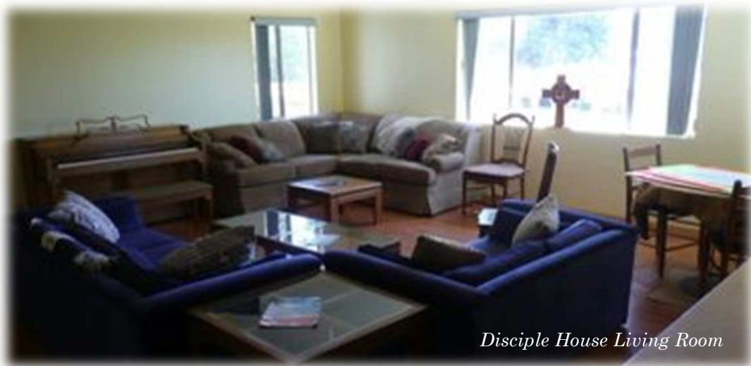
Disciple House Living Room