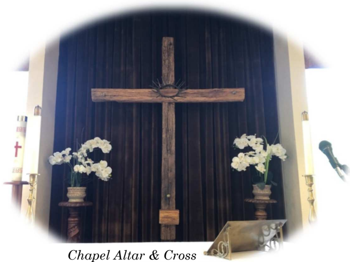
Chapel Altar & Cross

We are distinctly Anglican and intentionally missional.