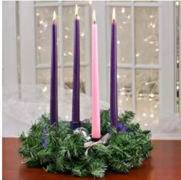
Prepare for His Coming

Welcome to your newsletter! Now you can keep track of everything that is going on at BotC & the CHC for the month and beyond.