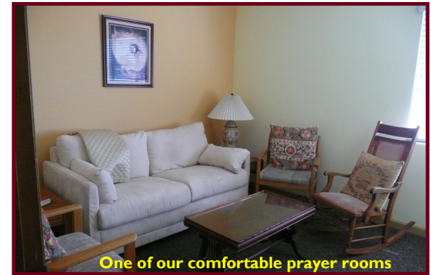
One of our comfortable prayer rooms