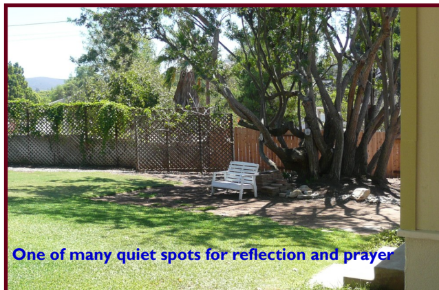
One of many quiet spots for reflection and prayer

Prayerees should be open to a blessed and impactful encounter with the Holy Spirit.