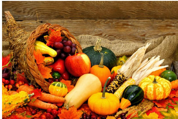
November the Month of Thankfulness

Welcome to your newsletter! Now you can keep track of everything that is going on at BotC & the CHC for the month and beyond.